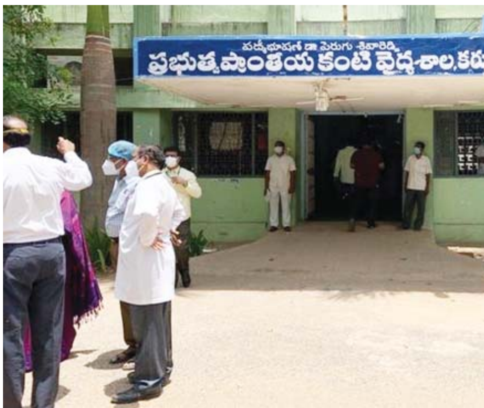
SONU SOOD ANNOUNCES OXYGEN PLANTS IN ANDHRA PRADESH.