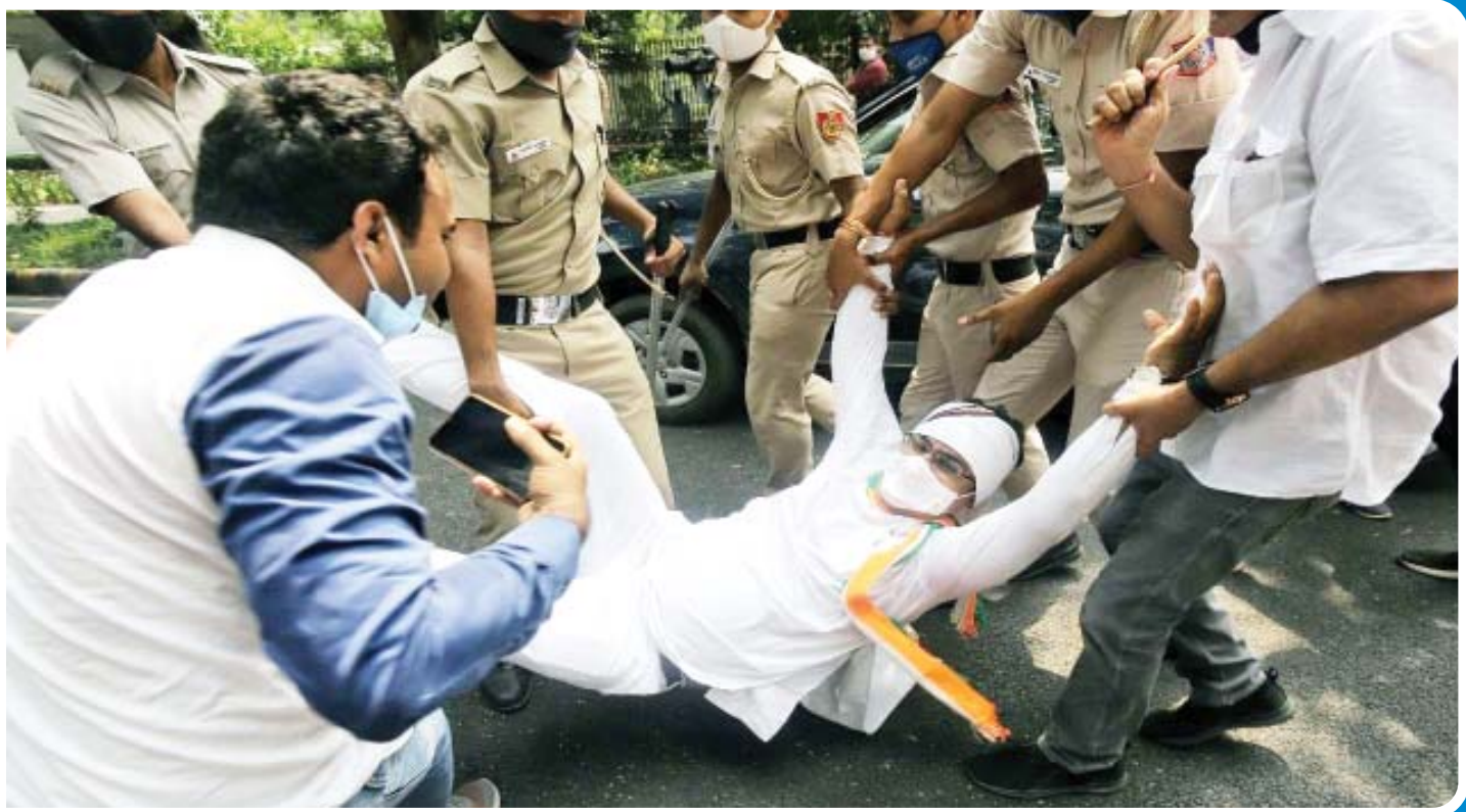
POLICE PERSONNEL DETAIN CONGRESS PARTY WORKER DURING A PROTEST AGAINST FARM BILLS, IN NEW DELHI ON MONDAY.