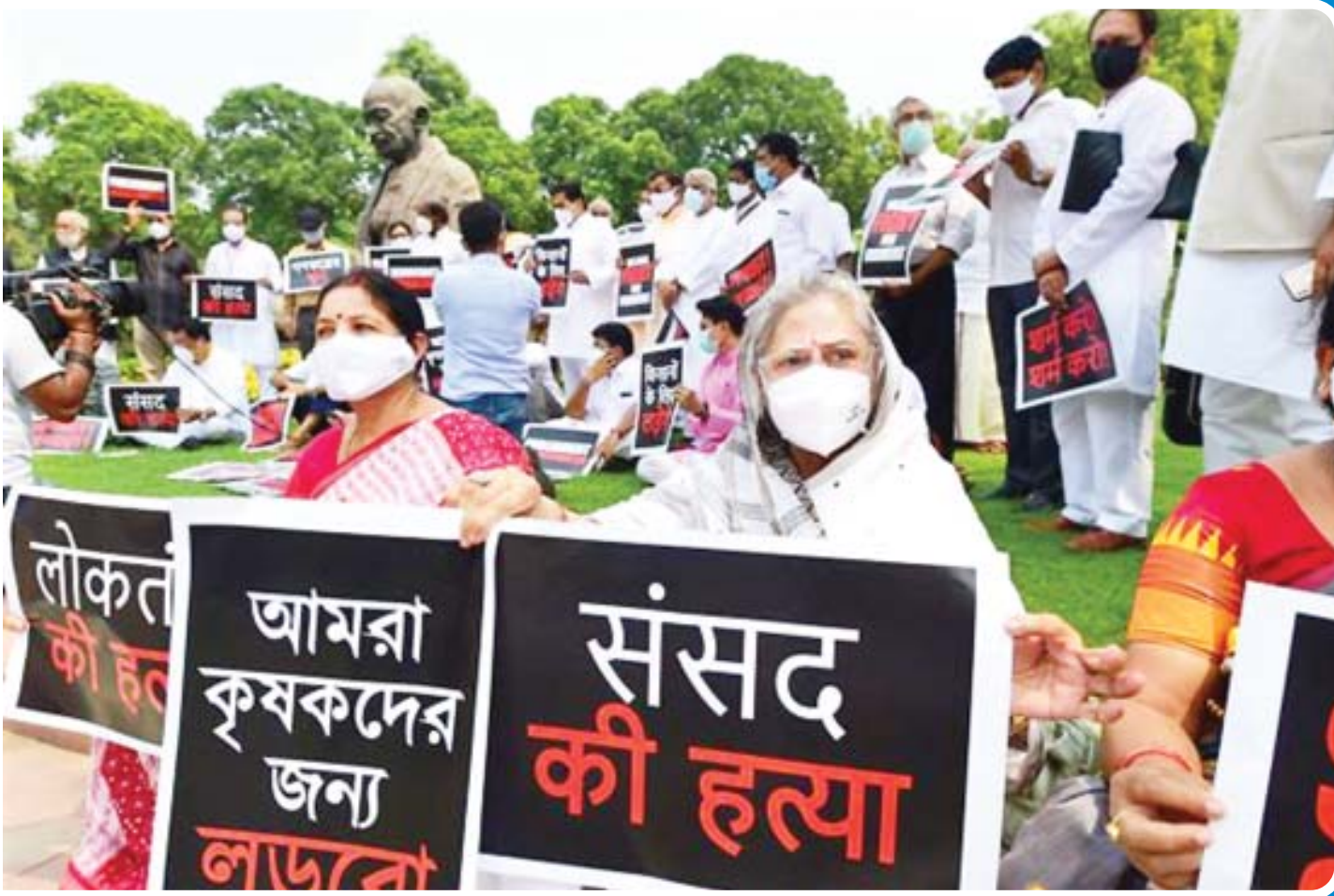
OPPOSITION LEADERS SEEK MEETING WITH PRESIDENT, URGE HIM NOT TO SIGN FARM BILLS.