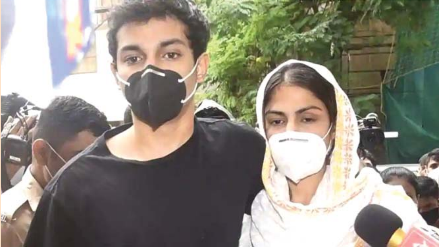
ACTOR RHEA CHAKRABORTY WITH BROTHER SHOWIK CHAKRABORTY.