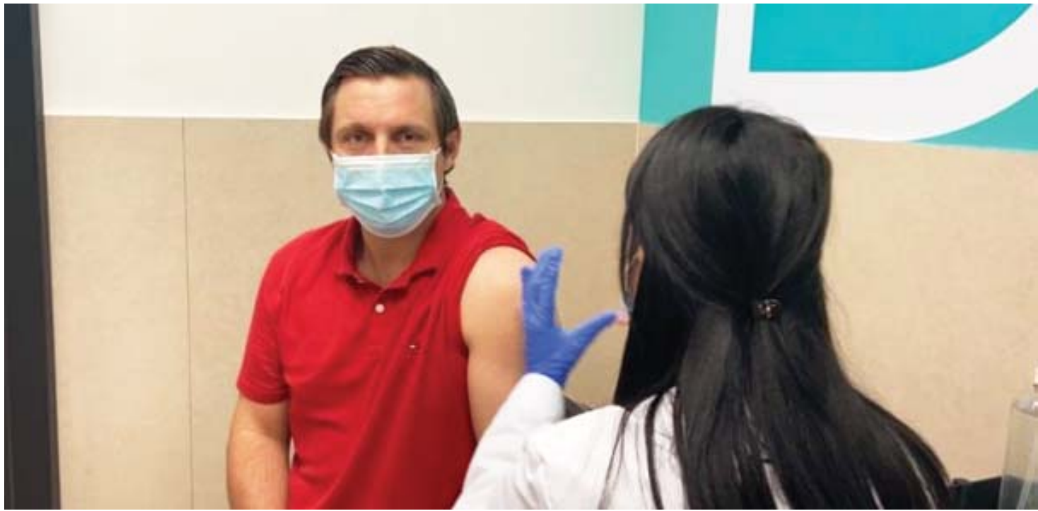
BRAMPTON'S MAYOR PATRICK BROWN RECEIVES ASTRAZENECA COVID-19 VACCINE.