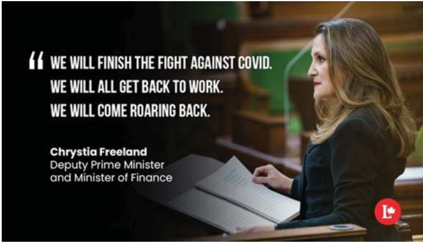
FEDERAL BUDGET PROMISES TO SUPPORT CHILD CARE, BUSINESS & JOB GROWTH. | DETAILS ON PAGE 7