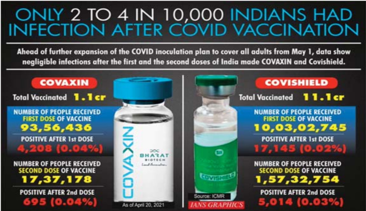
DATA SHOW NEGLIGIBLE INFECTIONS AFTER THE FIRST AND THE SECOND DOSES OF INDIA MADE COVAXIN AND COVISHIELD.