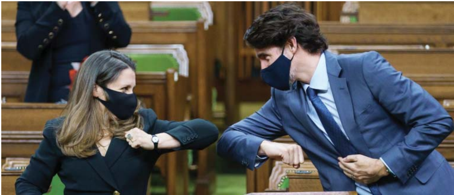
CANADA'S DEPUTY PRIME MINISTER AND MINISTER OF FINANCE, CHRYSTIA FREELAND, PRESENTED 2021 BUDGET ALONG WITH PM TRUDEAU.