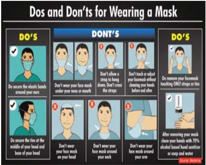
A LOOK: DOS AND DON'TS FOR WEARING A #MASK.