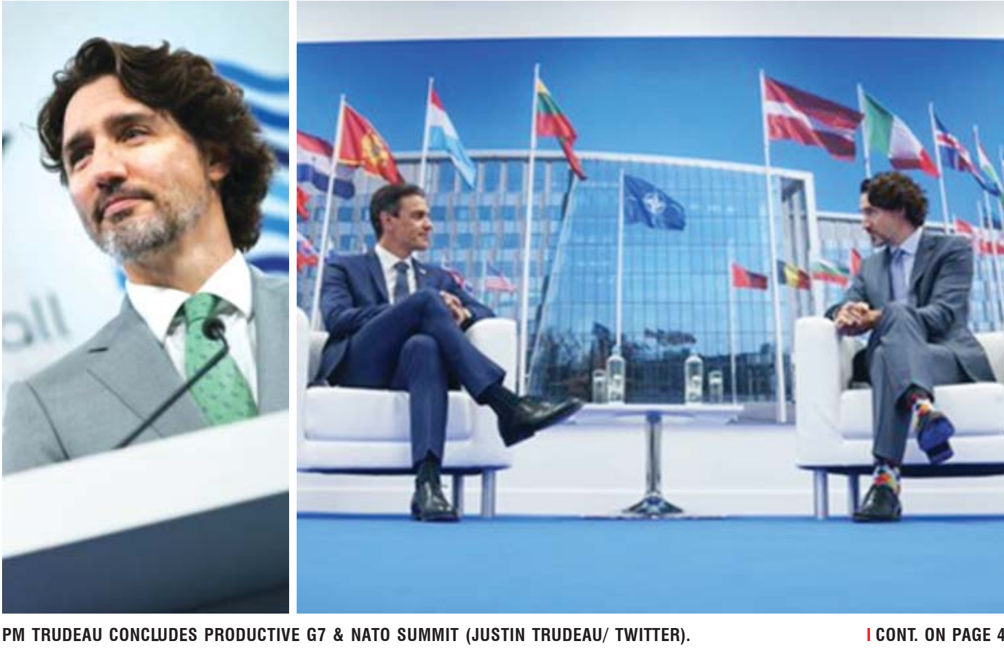
PM TRUDEAU CONCLUDES PRODUCTIVE G7 & NATO SUMMIT. I CONT. ON PAGE 4