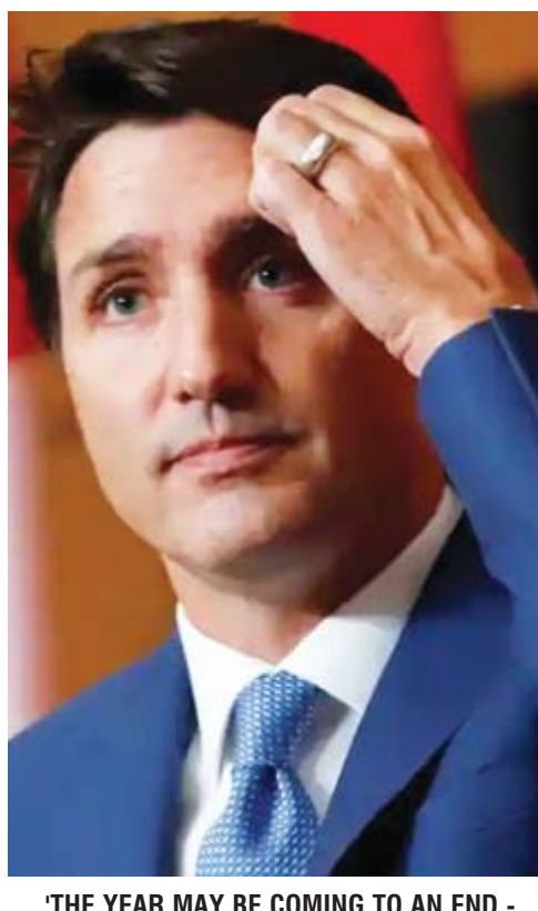
'THE YEAR MAY BE COMING TO AN END - BUT, WITH OMICRON SPREADING QUICKLY AROUND THE WORLD, IT'S CLEAR THAT THIS PANDEMIC ISN'T': PM JUSTIN TRUDEAU