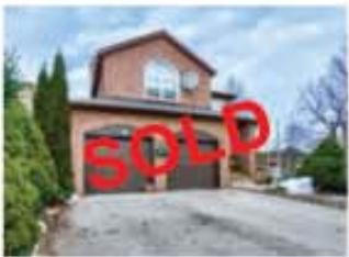
SOLD at 106% of asking in 10 Days