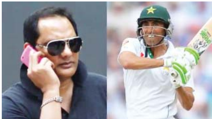
The Pakistan Cricket Board (PCB) may have declined to comment on the issue but former batting coach Grant Flower’s revelation about Younis Khan’s behaviour inside the dressing room refuses to die down.

Former Pakistan captain Rashid Latif has added a whole new dimension to it by bringing former India skipper Mohammed Azharuddin in the equation. “Younis Khan quite tough to master. I remember one incident in Brisbane, during the Test, at breakfast, I tried to give him a bit of batting advice... But he didn’t take kindly to my advice and brought a knife to my throat, with Mickey Arthur sitting alongside, who had to intervene,” Flower had said on ‘Following On Cricket Podcast’. Reacting on the matter, Latif said one of the reasons, why Flower made such a comment about Younis, could be Azharuddin. “We do not know what happens inside the dressing room. But Azharuddin can be a reason for this. In 2016, Younis made a double century at the Oval. He (Younis) did not take the name of the batting coach (Grant Flower). He said that I was struggling and talked to Azharuddin,” Latif said in YouTube show called ‘Caught