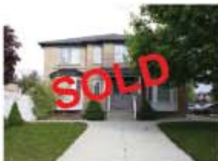
SOLD at 100% Asking