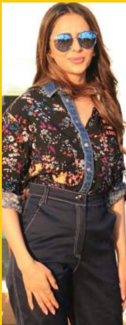
RAKUL PREET SINGH