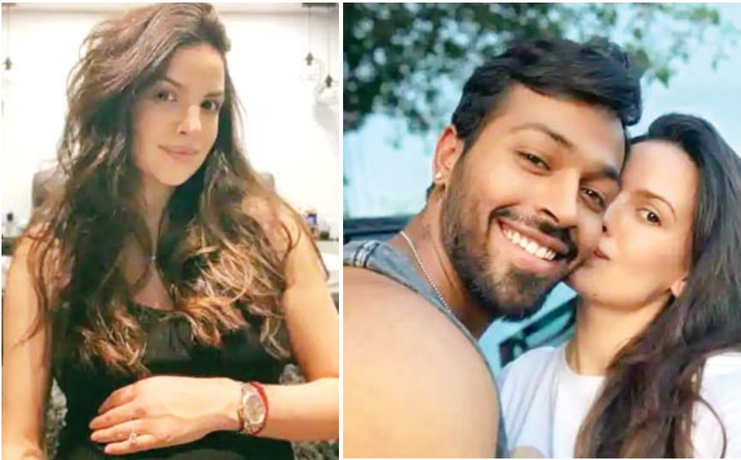
HARDIK PANDYA'S PARTNER NATASA STANKOVIC WAS SEEN CRADLING HER BABY BUMP IN NEW PICTURES SHARED ON INSTAGRAM. FORMER BIGG BOSS CONTESTANT AND DANCER NATASA STANKOVIC, WHO IS EXPECTING HER FIRST CHILD WITH CRICKETER HARDIK PANDYA, SHARED NEW PHOTOS ON HER INSTAGRAM PAGE. IN THE PICTURES, SHE IS WEARING A BLACK SPAGHETTI TOP AND CRADLING HER BABY BUMP. SHE HAS A RADIANT SMILE ON HER FACE.