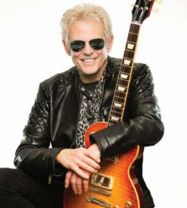
GUITAR LEGEND RON FELDER TO HEADLINE OSLER FUNDRAISING GALA ON NOVEMBER 23.