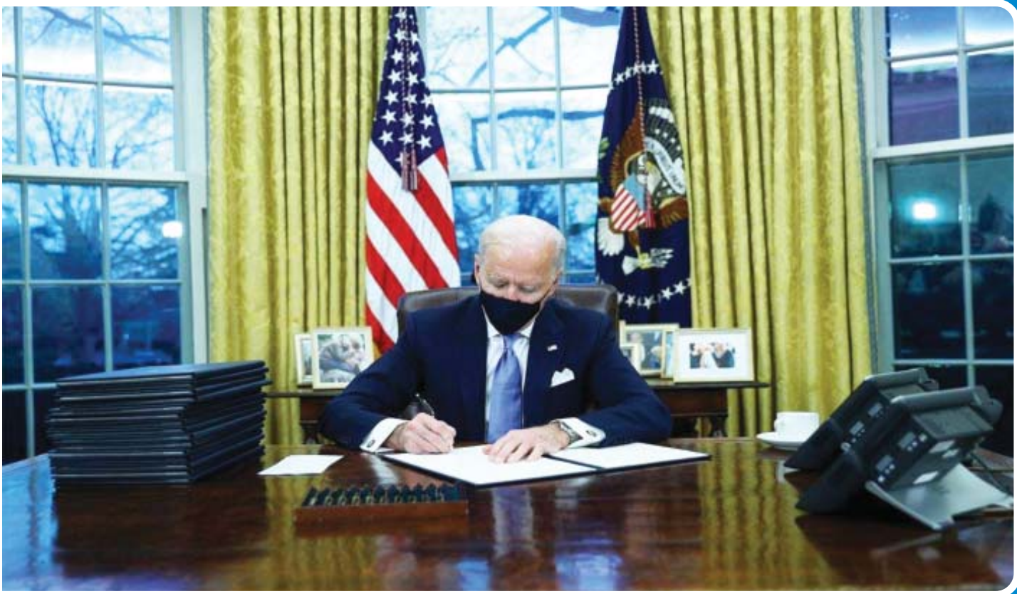
THE US WILL ASSESS WHETHER THE TALIBAN WAS LIVING UP TO ITS COMMITMENTS TO CUT TIES WITH TERRORIST GROUPS AND TO REDUCE VIOLENCE IN AFGHANISTAN.

Even as the violence level remains high in Afghanistan, the new Biden administration has made it clear that they plan to review the US-Taliban agreement of last year. The agreement key to US presence in Afghanistan was followed by the start of the Afghan government-Taliban talks in September. Last week saw talks between new US National Security Advisor Jake Sullivan and Afghan NSA Hamdullah Mohib with the White House readout saying, "Mr Sullivan also made clear the United States' intention to review the February 2020 US-Taliban agreement". The read out pointed out the US will assess, "whether the Taliban was living up to its commitments to cut ties with terrorist groups, to reduce violence in Afghanistan, and to engage in meaningful negotiations with the Afghan government and other stakeholders". The situation in the country remains precarious with no headway made on the talks between government and the Taliban and the latter increasing attacks in the country. In a bid to pave way for a "comprehensive political agreement", the Afghan government also released 6000 Taliban prisoners but it has not got any reciprocal strong response from the group. Over the weekend, the Afghan government asked Pakistan to "compel" the Taliban to reduce violence. The Afghan foreign ministry in a statement said, "We expect the Government of Pakistan and all our international partners to compel the