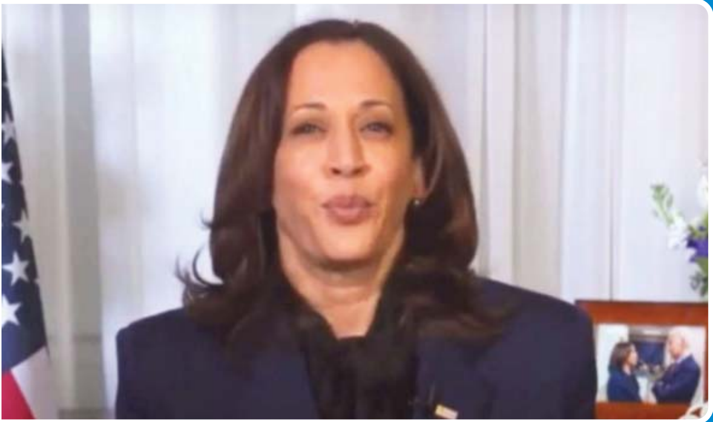
"I WANT TO URGE EVERYONE TO TAKE THE VACCINE WHEN IT IS YOUR TURN," KAMALA HARRIS SAID ON TUESDAY. "IT WILL SAVE YOUR LIFE."

US Vice President Kamala Harris on Tuesday took her second dose of the coronavirus vaccine in a televised setting at the National Institutes of Health (NIH) and urged Americans to get vaccinated. "I want to urge everyone to take the vaccine when it is your turn," Harris told C-SPAN viewers on Tuesday. "It will save your life." Harris received her first vaccine dose on December 29. Following a slow roll-out, after two coronavirus vaccines received emergency approval in December, the United States administered more than 1 million shots daily for the past week. President Joe Biden has said the goal of his administration is to vaccinate 100 million Americans in the first 100 days of his presidency. Meanwhile, the White House today said in a press release that the