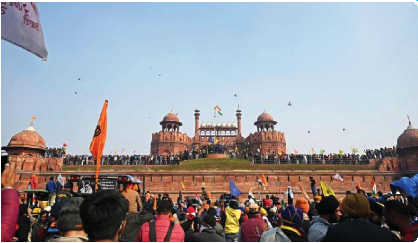
HUNDREDS OF FARMERS RIDING TRACTORS, BIKES AND CARS REACHED RED FORT AND ENTERED ITS PREMISES.

Farmers, who had occupied the borders of Delhi and were seen as friendly and peaceful for over 60 days as they waited for the government to revoke the farm laws, suddenly left behind a trail of vandalism, violence, and hooliganism as they hoisted their flags at the iconic Red Fort after running amok through the national capital clashing with the police personnel. Hundreds of farmers riding tractors, bikes and cars reached Red Fort and entered its premises. One of the protesters went up the mast on the ramparts of the fort and hoisted the farmer union flags and saffron pennant with a Sikh religious symbol. The flag was hoisted at the place where the Tricolour is hoisted. The protestors came to central Delhi deviating from the route which had been decided for tractor march. Violence erupted near ITO area after the protesters chased police with their tractors, damage several DTC buses near ITO as they are prevented from moving towards the Red Fort. Some of the protestors even tried to run over police personnel deployed in the area.