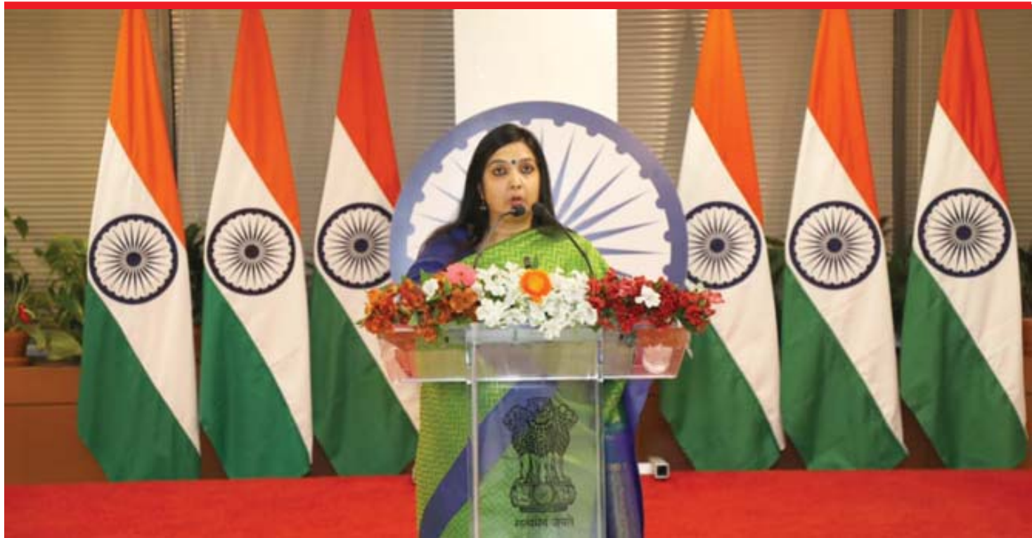
CONSUL GENERAL OF INDIA APOORVA SRIVASTAVA ADDRESSING THE DIASPORA ON REPUBLIC DAY VIRTUAL CELEBRATIONS AT THE INDIAN CONSULATE IN TORONTO.

led by Flight Lieutenant Tanik Sharma. It was followed by the Air Force Tableau titled 'Indian Air Force: Touch the Sky with Glory'. The Air Force tableau showcased scaled down models of Light Combat Aircraft, Light Combat Helicopter, Su-30 MK-I aircraft and Rohini radar against a sky-blue background. The smartly attired officers in their flying overalls stood alongside the models. Thirty-two tableau -- 17 from states and union territories, nine from various ministries, departments and paramilitary forces and six from the defence ministry, depicting the nation's rich cultural heritage, economic progress and defence prowess rolled down the Rajpath. School children performed folk arts and crafts displaying skills and dexterity handed down from generations; Bajasal, one of the most beautiful folk dances of Kalahandi, Odisha; Fit India Movement, Aatmanirbhar Bharat. The 122-member proud contingent of the Bangladesh Armed Forces comprising soldiers of the Bangladesh Army, sailors of the Bangladesh Navy and Air Warriors of the Bangladesh Air Force lead the contingent march on the Rajpath. The Bangladesh contingent carried the legacy of legendary Muktiyoddhas of Bangladesh, who fought against oppression and mass atrocities and liberated Bangladesh in 1971. The grand event culminated with Rafale aircraft flying at a speed of 900 kilometre per hour carrying out a 'Vertical Charlie'.