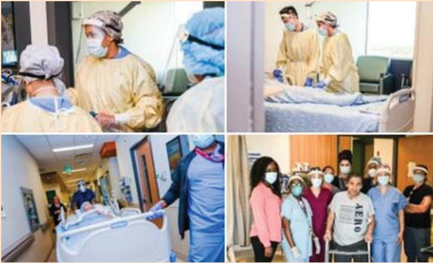
HUMBER RIVER HOSPITAL MARKS THE ONE YEAR ANNIVERSARY OF THE FIRST COVID19 CASE IN #ONTARIO. IN THE LAST YEAR, WE HAVE TREATED OVER 1,205 COVID PATIENTS AND DONE OVER 133K SWABS AT OUR ASSESSMENT CENTRES.