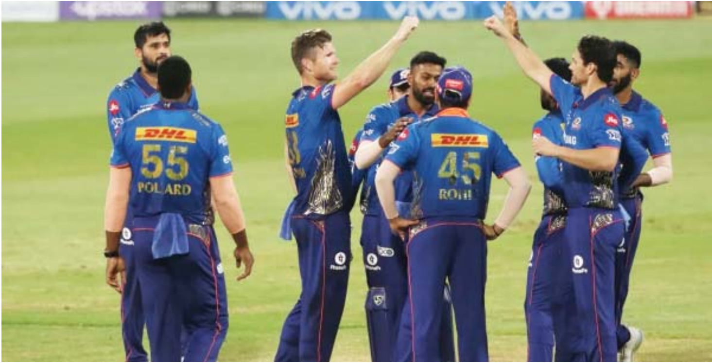
HAPPY FACES FOR MUMBAI INDIANS WITH JIMMY NEESHAM AND NATHAN COULTER-NILE STRIKING TWICE EACH IN THEIR FIRST TWO OVERS, RAJASTHAN ROYALS VS MUMBAI INDIANS, IPL 2021, SHARJAH, OCTOBER 5, 2021.

Vol 21 Issue 40, Phone 647-272-8182, 905-670-3687