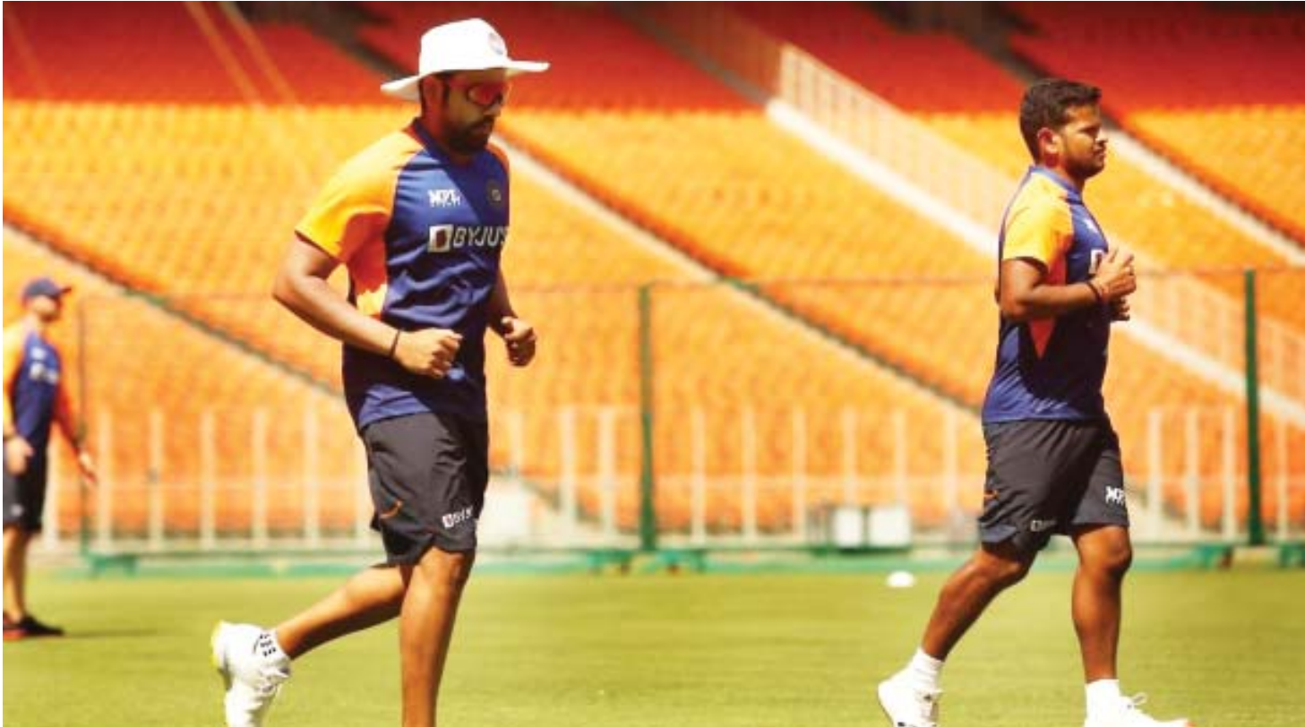
TEAM INDIA'S TRAINING SESSION AT THE MOTERA AHEAD OF THE PINK-BALL TEST.

If the pitch for the Day-Night Test at Motera behaves on the same lines as the one for the second Chennai Test, it would neither surprise nor disappoint Rohit Sharma. The Indian opener, who hit a match-setting 161 in the first innings on a rank-turner to help the team get back on terms in the series, sees nothing wrong in teams exploiting home advantage in terms of pitch and conditions. He argued that both teams have the opportunity to utilise the surface on offer. The pitch for the second Test aided spinners from the start, with the Indian trio of Ravichandran Ashwin, Axar Patel and Kuldeep Yadav much more adept at using it than their England counterparts, Jack Leach and Moeen Ali. It's a formula that is likely to be carried forward in the pink-ball Test, which usually is dominated by seam and swing bowlers. Rohit doesn't see anything wrong in it. "...The pitch is the same for both the teams, so I don't know why this topic is raised every time. Both the teams play on the same pitch. People say pitches shouldn't be like this or that but for years Indian pitches are made like this only," Rohit said during a virtual press conference. "I don't think there needs to be any changes. Every team takes advantage of their home conditions." India's chances of qualifying for the World Test Championship (WTC) final in June depends on the outcome of the England series, and defeat in the first match has prompted the think-tank to throw the spin-punch at the visitors.