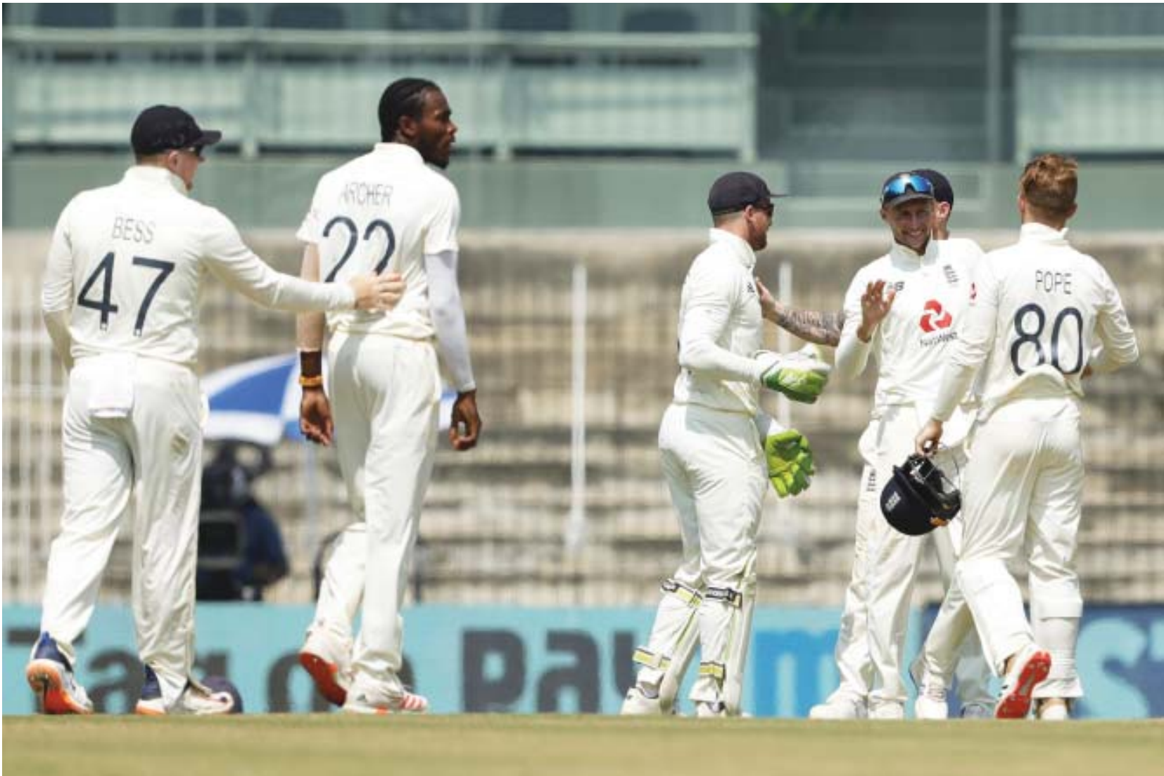
JOE ROOT AND HIS MEN CELEBRATE THE 1-0 LEAD.