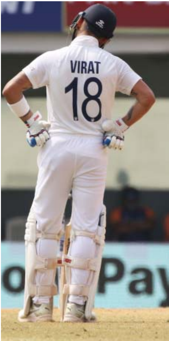
A DEJECTED VIRAT KOHLI REACTS AS WICKETS TUMBLE