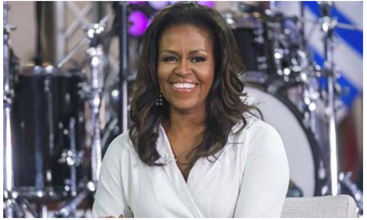
THE FORMER FIRST LADY ALSO TALKS ABOUT HOW THE PANDEMIC HELPED HER AND HER HUSBAND RECLAIM "STOLEN MOMENTS" WITH MALIA, 22, AND SASHA, 19, WHO BOTH RETURNED HOME FROM COLLEGE TO QUARANTINE WITH THEIR PARENTS AT THE FAMILY HOMES IN WASHINGTON AND MARTHA'S VINEYARD, MASSACHUSETTS.