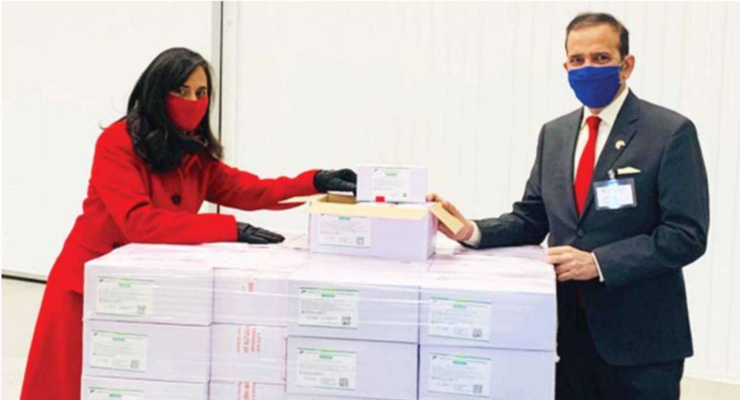
INDIA-CANADA TIES STRENGTHENED- MINISTER OF PUBLIC SERVICES & PROCUREMENT, ANITA ANAND, AND HIGH COMMISSIONER OF INDIA TO CANADA, AJAY BISARIA, RECEIVE FIRST 500,000 DOSES OF COVISHIELD VACCINE FROM SERUM INSITUTE OF INDIA.