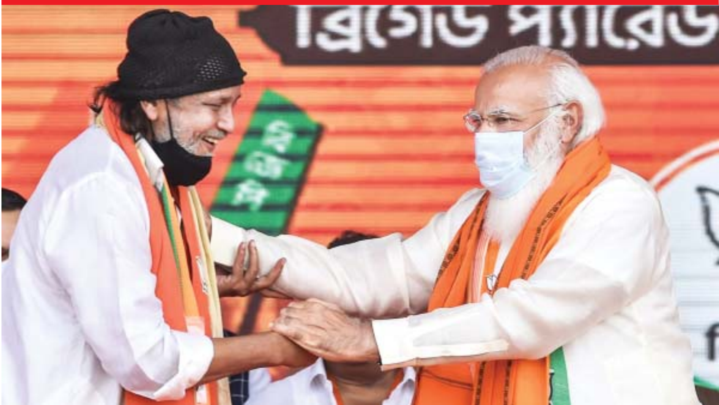
Y MEDIA POLITICAL SENSEX, 5 STATE ELECTION, INDIA: MITHUN CHAKRABORTY JOINS BJP RALLY IN KOLKATA. | DETAILS ON PAGE 5