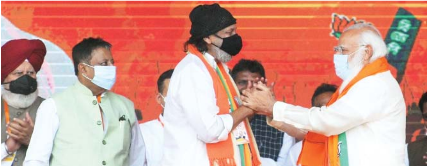
PRIME MINISTER NARENDRA MODI WELCOMES FILMSTAR MITHUN CHAKRABORTY.

KOLKATA, (IANS) Bollywood star Mithun Chakraborty, who joined Prime Minister Narendra Modi’s rally in Kolkata on Sunday, referred to himself as a “pure Cobra who can kill in just one bite”. “I am proud to be a Bengali. I know you love my dialogues. This day is like a dream-come-true experience for me,” said Chakraborty, while addressing the mammoth gathering here. Thrilling the huge crowd with popular dialogues from his films, the actor said: “Marbo ekhaney...lash porbay shoshaney (I will thrash you here. Your body will be found at the crematorium).” He also delivered another punch line. “Ami joldhorao noi, bele-borao