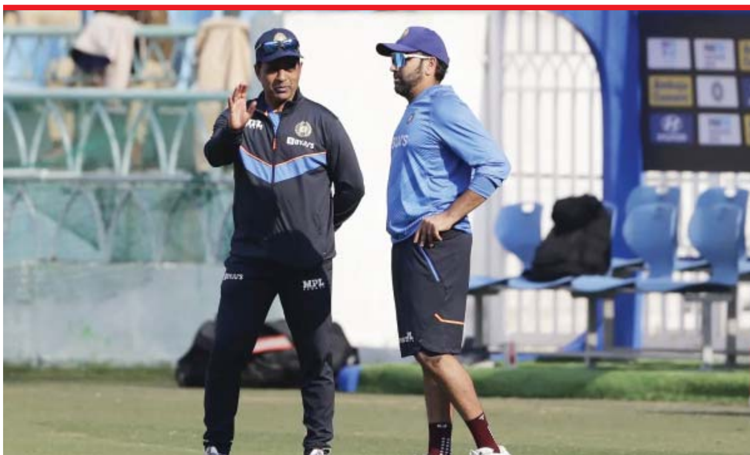
SUNIL JOSHI AND ROHIT SHARMA PLOT INDIA'S PATH TO THE 2022 T20 WORLD CUP, LUCKNOW, FEBRUARY 22, 2022.