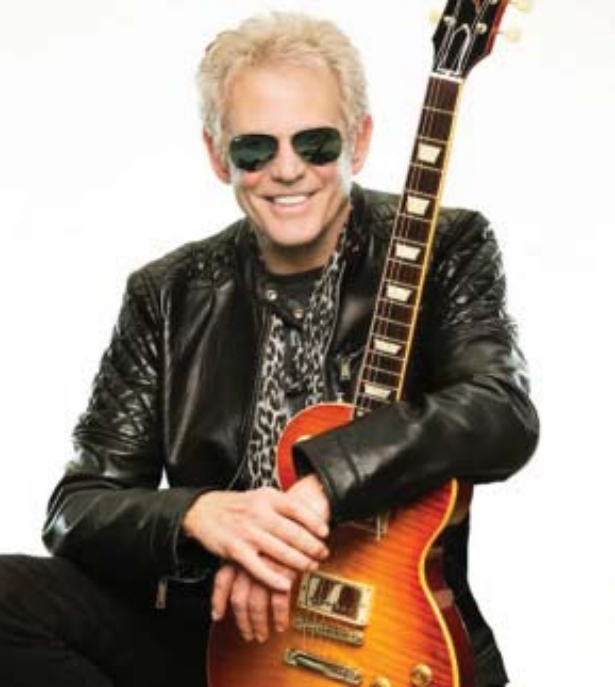
GUITAR LEGEND RON FELDER TO HEADLINE OSLER FUNDRAISING GALA ON NOVEMBER 23.