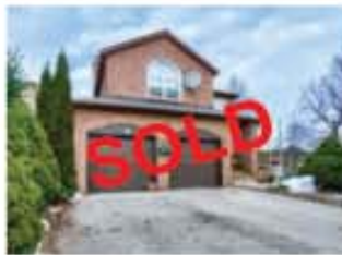
SOLD at 106% of asking in 10 Days