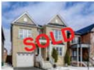
SOLD at 100% of asking in 1 Day