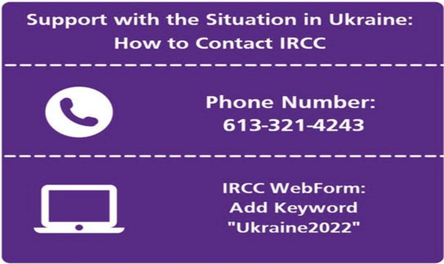
CANADA'S IMMIGRATION SUPPORT FOR THOSE AFFECTED BY THE SITUATION IN UKRAINE (IRCC/ TWITTER).