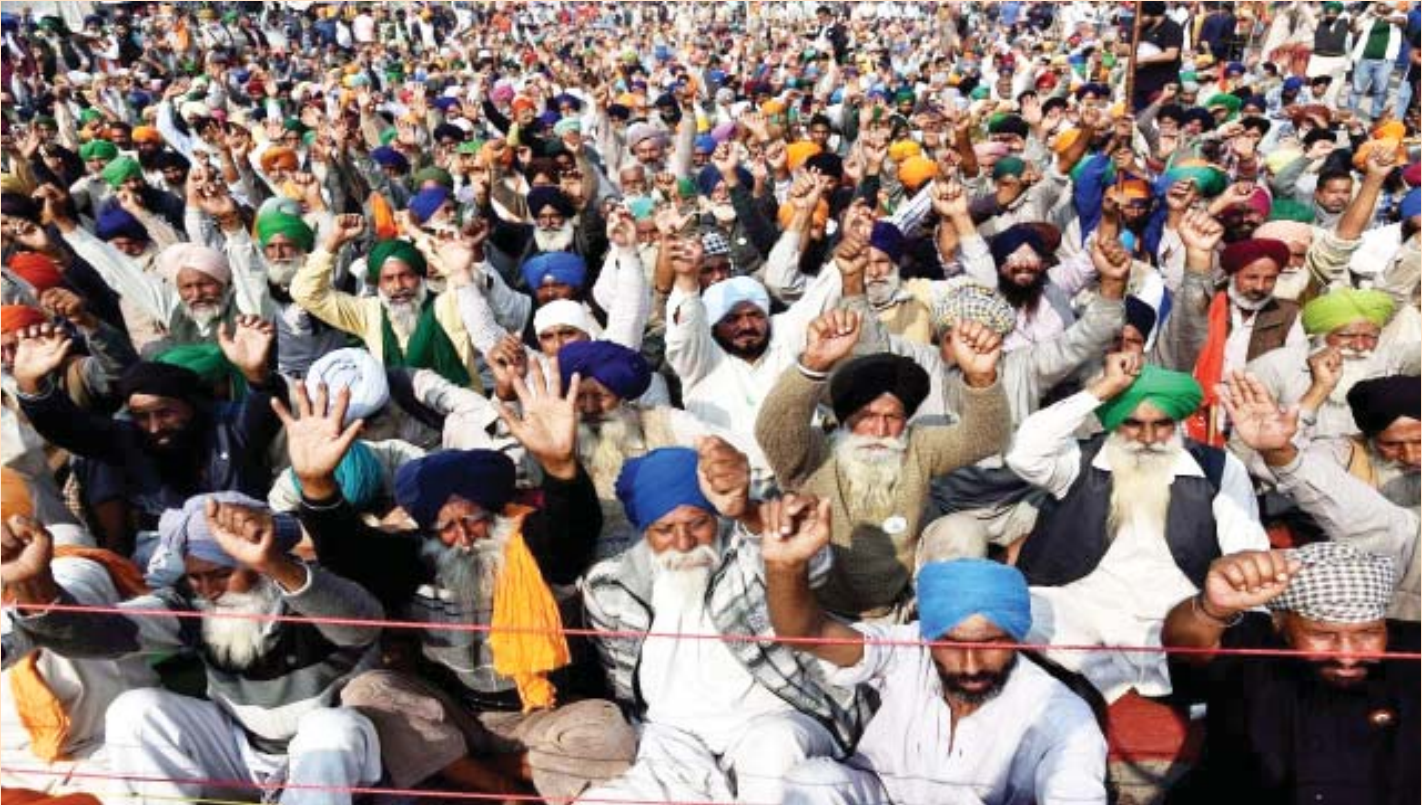
FARMER UNIONS MONDAY ANNOUNCED A COUNTRYWIDE 'CHAKKA JAM' ON FEBRUARY 6 WHEN THEY WOULD BLOCK NATIONAL AND STATE HIGHWAYS FOR THREE HOURS.