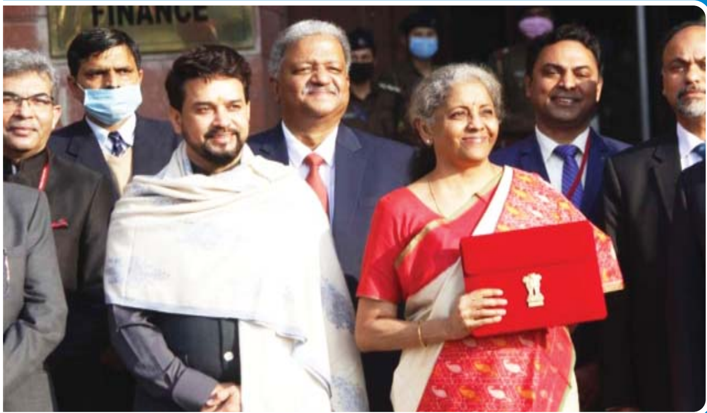
SITHARAMAN, REPLACING HER SIGNATURE 'BAHI KHATA', OPTED TO CARRY THE DOCUMENTS IN A TABLET, WHICH WAS WRAPPED IN A RED-COLOURED COVER.

For her third budget presentation, Union Finance Minister Nirmala Sitharaman kept her look simple, donning a crisp red-coloured saree with off-white detailing and gold border. She completed her look with a gold chain and bangles and tiny earrings. Amid the ongoing coronavirus pandemic, replacing her signature 'bahi khata', she opted to carry the documents in a tablet, which was wrapped in a red-coloured cover with national emblem emblazoned on it. The red colour, which is considered auspicious, represents the strongest emotions including love, energy, attention, and power. Sitharaman's sartorial choices have made headlines on many occasions - from donning beautiful handloom sarees to sporting silk sarees. For the unversed, she likes wearing subtle yet classy handloom and silk sarees to work. And it is safe to say that it is her wardrobe arithmetic that gives her appearance a distinct stamp. For the 2020-21 budget presentation, the Union Finance Minister had opted for a crisp yellow-gold silk saree with a blue border and matching blouse. The minister had carried the documents in a traditional 'Bahi-Khata' (ledger) which she trademarked during the 2019-20 budget presentation. The colour yellow, which is considered as a mark of prosperity, is also believed to be auspicious on important occasions. During her maiden budget presentation in 2019, Sitharaman grabbed