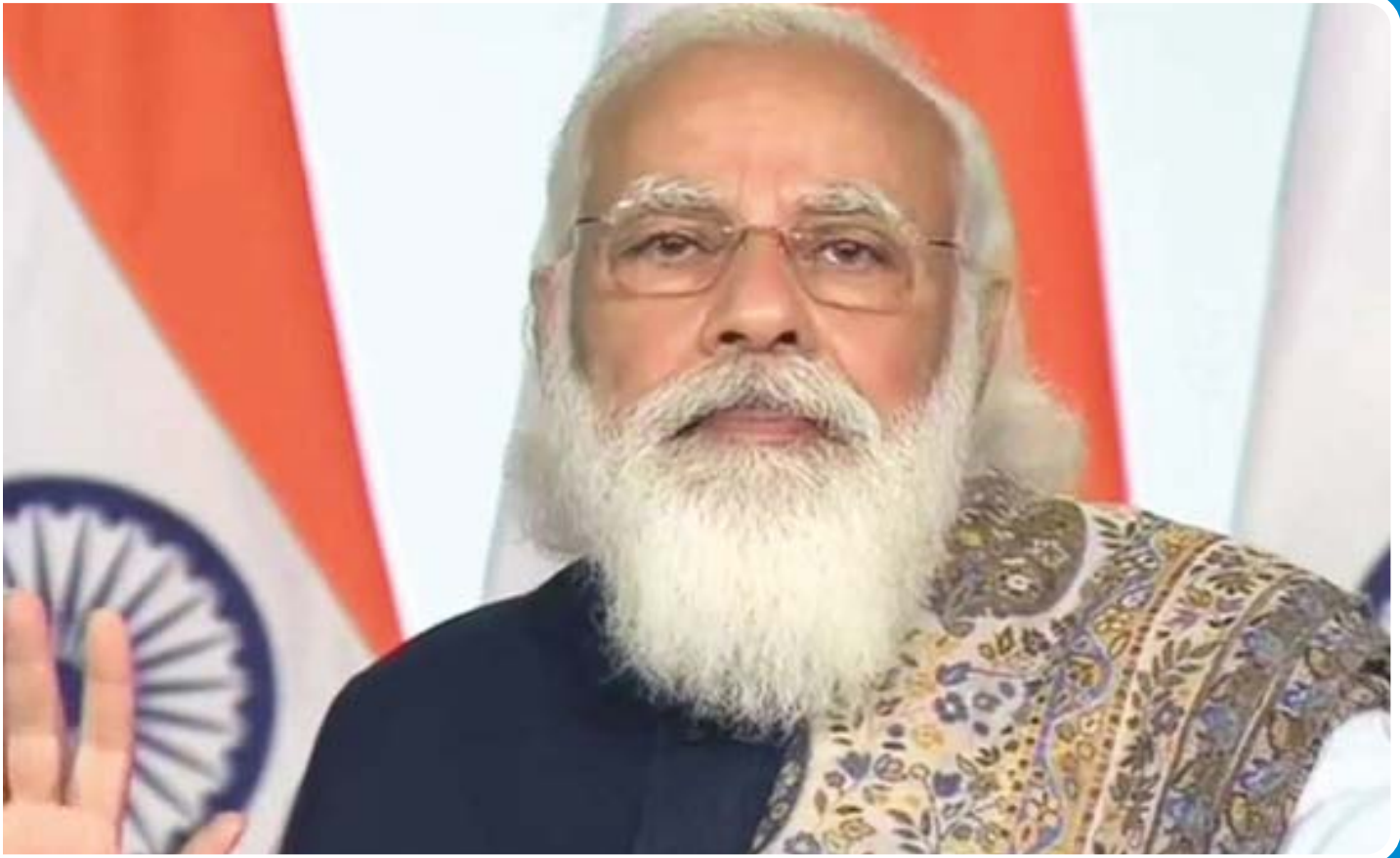
PM MODI ALSO SAID AT THE ALL-PARTY MEET THAT THE PARTIES WITH LESS MPS SHOULD GET AMPLE TIME TO PUT FORTH THE ISSUES OF THEIR STATES.

During the all-party meeting on Saturday (January 30), Prime Minister Narendra Modi asserted that smaller parties (having fewer MPs in Parliament) should get an ample amount of time to present their views and issues pertaining to their states, according to Union Minister of Parliamentary Affairs Pralhad Joshi. While talking to the media, the minister gave details about the all-party meeting. "During all-party meetings, smaller parties demanded that they should get an ample amount of time to put forth issues pertaining to their states, to which PM Modi said that the government agrees to it. He urged all the big parties including BJP not to disrupt the house as when the house is disrupted, most of the harm is done to small political parties as their time gets deducted. PM Modi said that everyone should appeal that the house should continue to function without disruption," Joshi said. Joshi said that all-party meeting has been conducted in the presence of Prime Minister Narendra Modi and Defence Minister Rajnath Singh. "Almost all parties participated in the meeting. Opposition parties have demanded a discussion on Farm laws and farmers' issues. We agreed. In the end, the Prime Minister said that the offer which has been given by Agriculture Minister Narendra Singh Tomar on January 22 still stands and the government is ready for the discussion on all