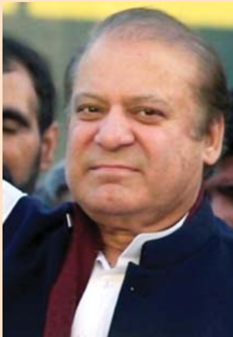
STRUGGLE NOT AGAINST IMRAN KHAN BUT THOSE WHO BROUGHT HIM INTO POWER: NAWAZ SHARIF