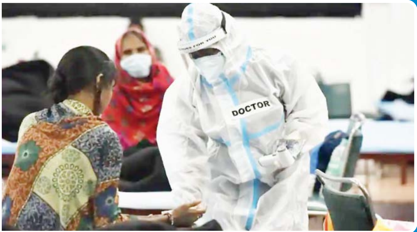
DURING MEDIA BRIEFING, UNION HEALTH MINISTER DR HARSH VARDHAN SAID THAT THE FIRST VACCINE WOULD LIKELY BE AVAILABLE BY THE FIRST QUARTER OF NEXT YEAR.

As the world races to develop a potential vaccine against coronavirus (Covid-19), the Ministry of Health and Family Welfare on Monday said that the first vaccine in India will most likely be available by early 2021. The health ministry said the research to develop a Covid-19 vaccine is being “done expeditiously”. During a media briefing, Union health minister Dr Harsh Vardhan said, “Research to develop a vaccine is being done expeditiously. There are at least 3 viable such vaccine candidates that are in the phase of clinical trials right now in the country. We’re hopeful that within 1st quarter of 2021 it will be