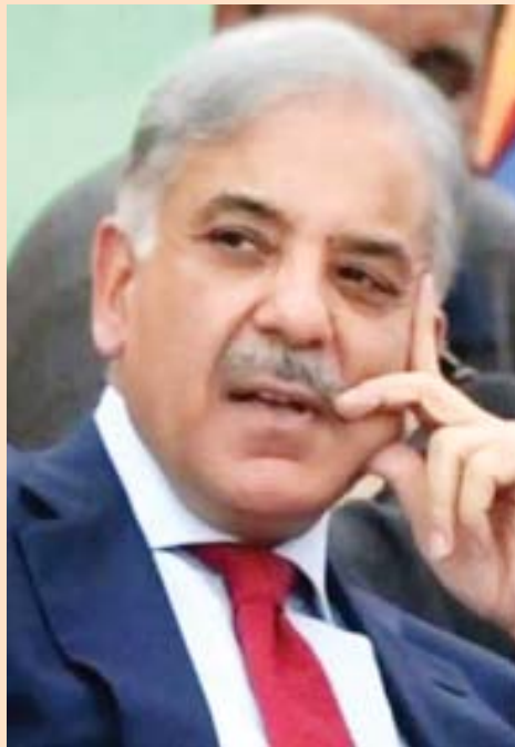
NAB-NIAZI NEXUS HAS FAILED: SHAHBAZ SHARIF