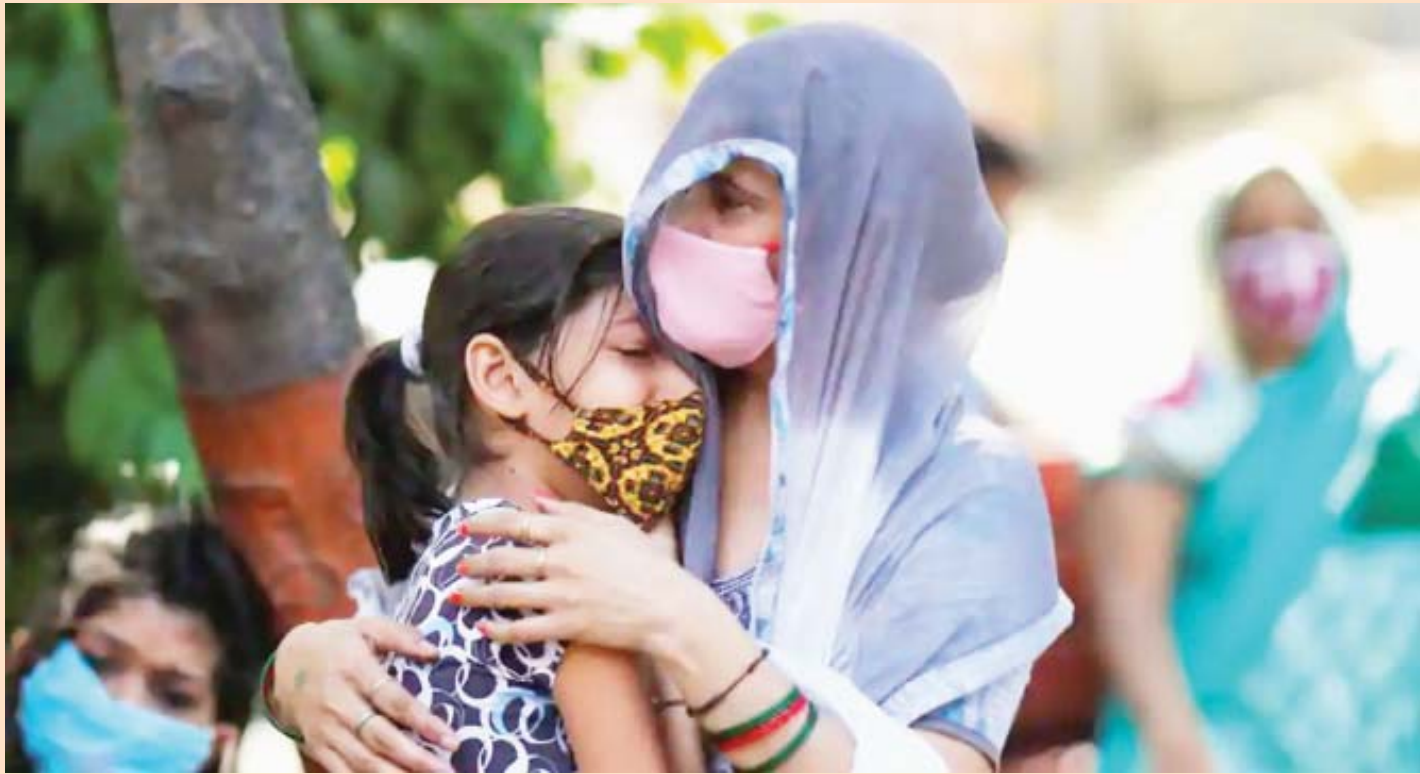
RELATIVES MOURN THE DEATH OF A MAN DUE TO THE CORONAVIRUS DISEASE (COVID-19), AT A CREMATORIUM IN NEW DELHI, INDIA.