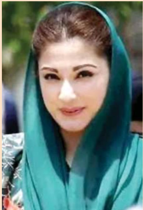
SHEHBAZ ARRESTED BECAUSE HE STOOD BY NAWAZ, SAYS MARYAM NAWAZ