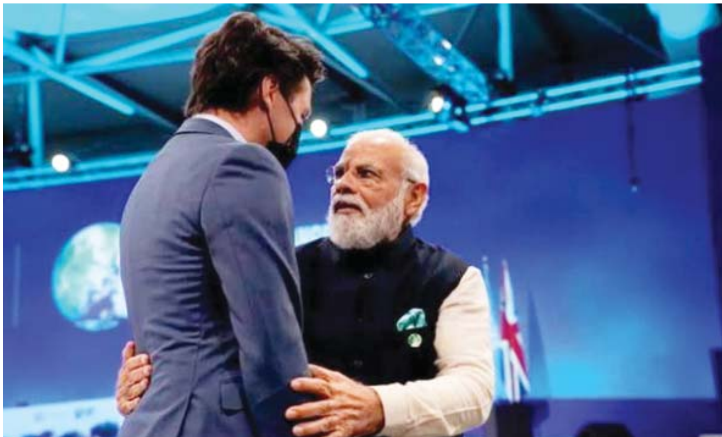
INDIA PUSHES RENEWED TRADE TALKS WITH CANADA (PM TRUDEAU & PM MODI AT G7 SUMMIT). CONTD. ON PAGE 7