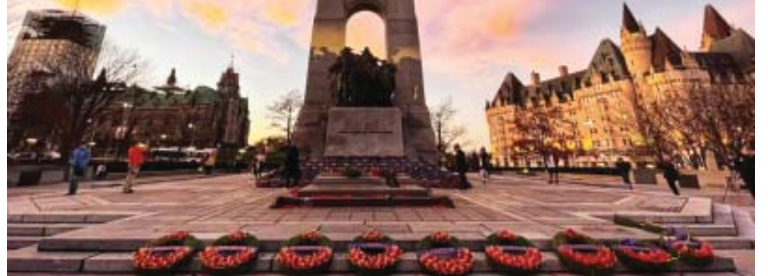
75th anniversary of the end of the Second World War marks ceremony at National War Memorial.