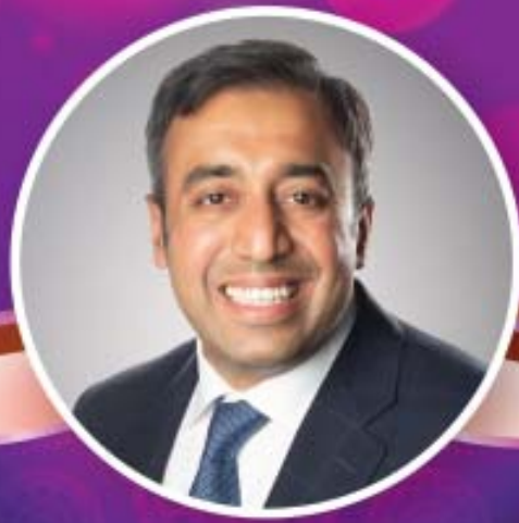
Kaleed Rasheed, MPP Mississauga East-Cooksville kaleedrasheed.com