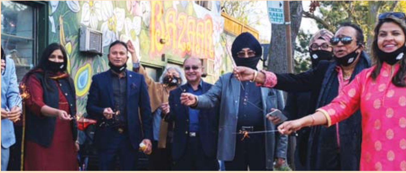
CONSUL GENERAL APOORVA SRIVASTAVA ATTENDED THE INAUGURATION OF DIWALI CELEBRATIONS AT GERRARD INDIA BAZAAR ON 6 NOVEMBER. SHE ALSO TOURED THE BAZAAR AND INTERACTED WITH THE BUSINESS COMMUNITY ON GERRARD STREET.