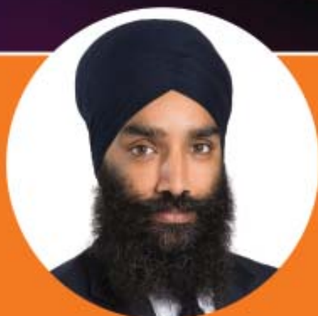
Gurratan Singh MPP Brampton East