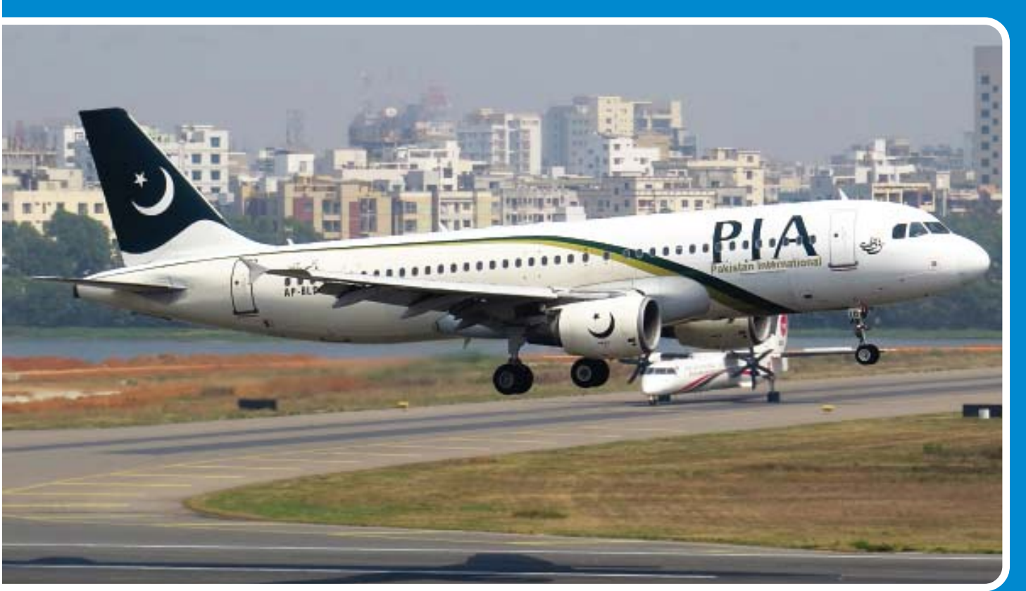
THE DEVELOPMENT CAME AFTER ITS FLAG CARRIER PAKISTAN INTERNATIONAL AIRLINES (PIA) HAS ALREADY BEEN BANNED FROM TAKING FLIGHTS TO THE UK AND THE EUROPEAN UNION AFTER THE LICENSING SCAM CAME TO LIGHT.