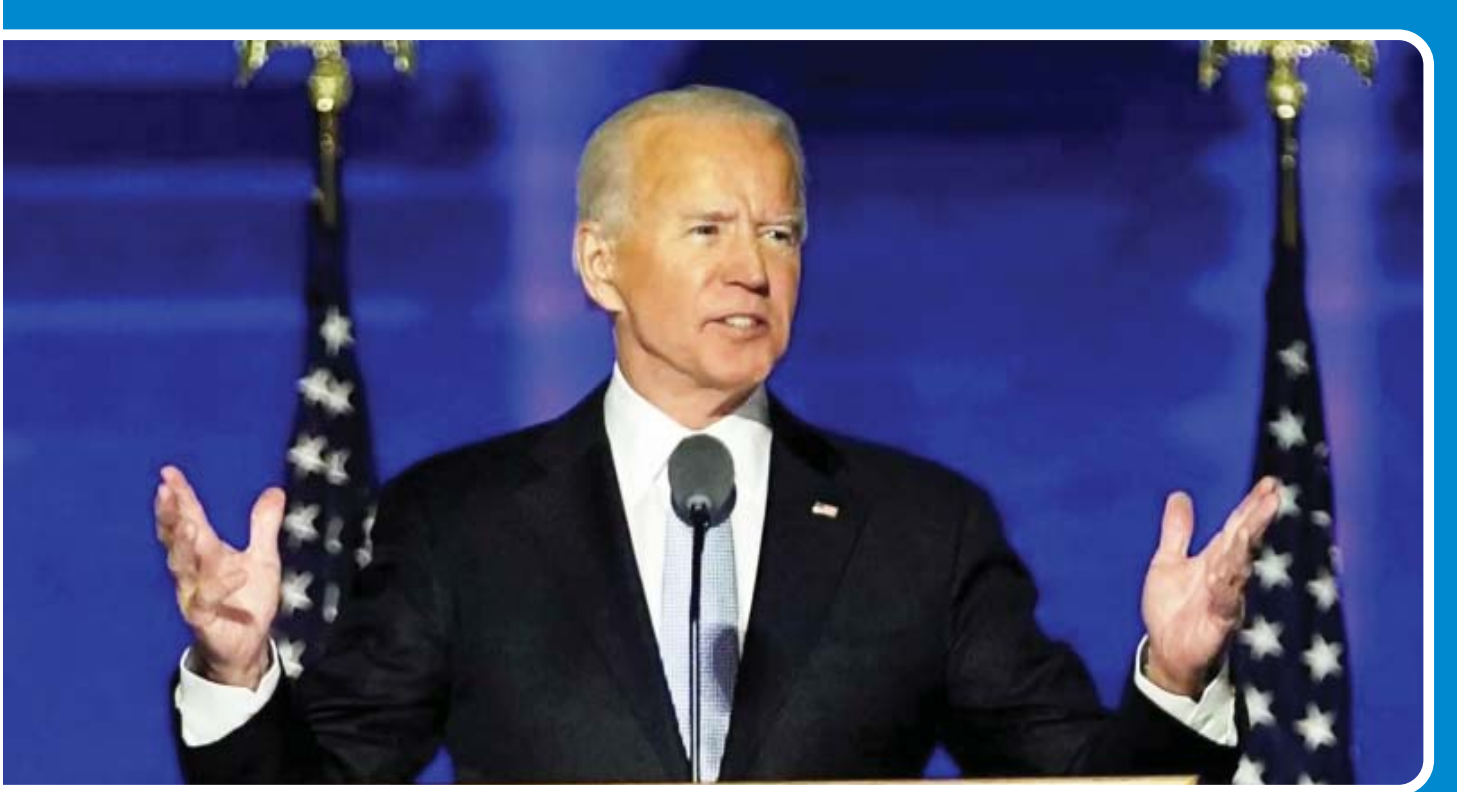
JOE BIDEN AND KAMALA HARRIS GAVE THEIR VICTORY SPEECHES AMID A SEA OF HONKING CAR HORNS AND CHEERING SUPPORTERS WAVING AMERICAN FLAGS IN AN OUTDOOR EVENT. BIDEN SAID HE WAS HUMBLLED BY THE TRUST AND CONFIDENCE THAT AMERICA HAS PLACED IN HIM.