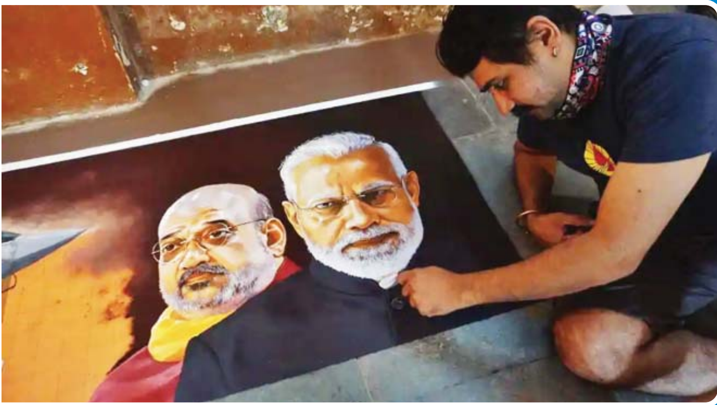
RANGOLI ARTISTS ARE SEEN GIVING THEIR FINAL TOUCH ON RANGOLI OF PM NARENDRA MODI AND HOME MINISTER AMIT SHAH AT THANE. THE BJP AND THE JD(U) HAVE WON 73 AND 43 SEATS IN THE NEW ASSEMBLY.