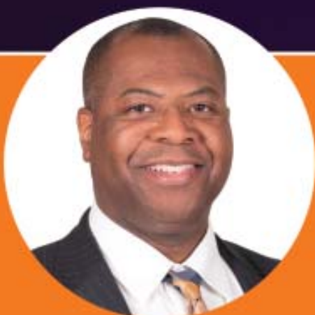
Kevin Yarde MPP Brampton North