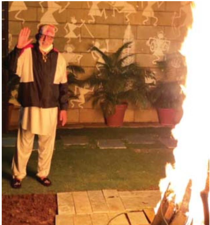
AMITABH BACHCHAN SHARED A PHOTO OF HIMSELF CELEBRATING HOLIKA DAHAN ON SUNDAY NIGHT, GIVING A GLIMPSE OF THE CELEBRATION AT HOME.