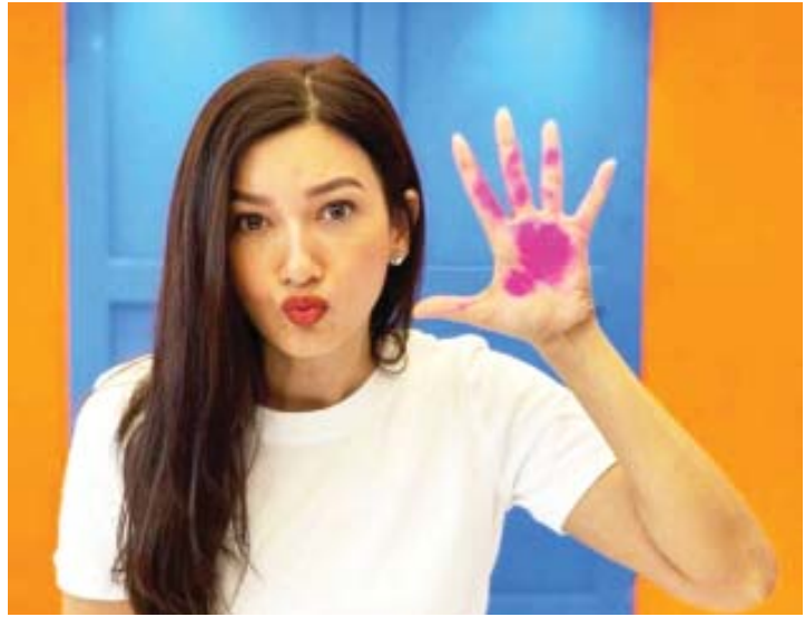
GAUAHAR KHAN WISHED HER FANS WITH A FEW PHOTOS AND VIDEOS OF HERSELF DANCING ON HOLI SONGS. SHE WROTE ON INSTAGRAM, “I WISH FOR ALLLLLLLLLLL COLORS OF LOVE, HAPPINESS, SUCCESS N HEALTH, AAP SAB KI ZINDAGI MEIN.... MERA FAVE PYAAR KA LAAL RANG... AAPKA JALDI BATAIYE..”