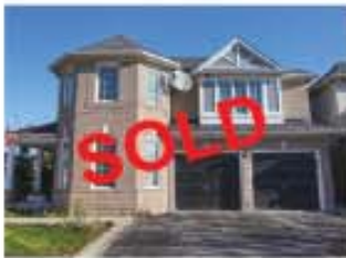
SOLD at 100% of Asking Price