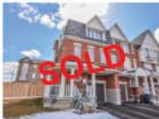
SOLD 100% of Asking in 5 days