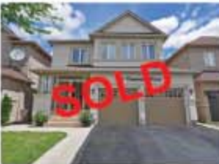
SOLD 30,000 Above Asking