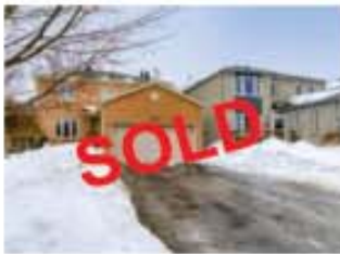
SOLD at 120% of Asking in 6 Days