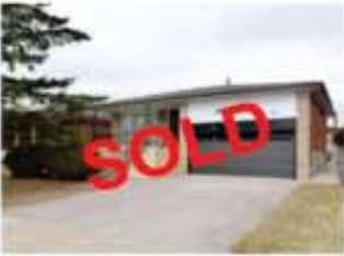
SOLD at 105% of Asking in 2 Days