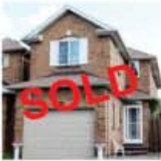
SOLD at 106% of Asking in 2 Days