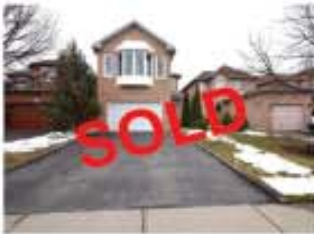
SOLD at 103% of Asking