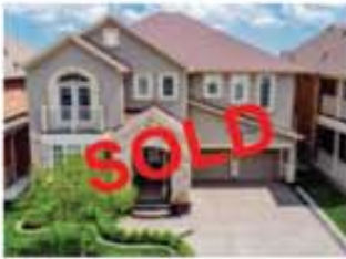
Secured Great Deal for the Client