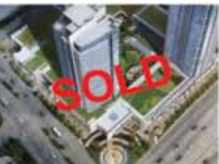
SOLD at 100% Asking