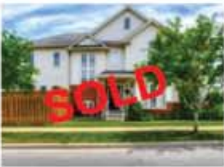
SOLD at 103% of asking in 6 Days