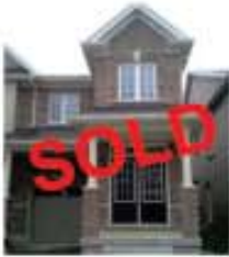
SOLD at 97% of Asking