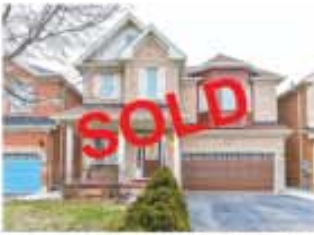
Secured Great Deal for the Client