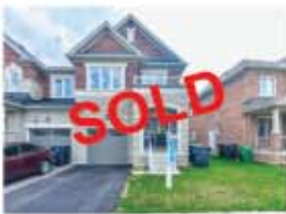
SOLD at 100% Asking in 1 day