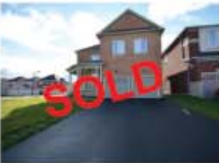
Secured Very Good Deal for Client