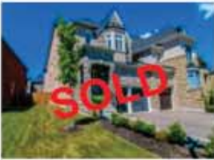
Secured Great Deal for the Client