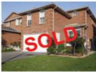
SOLD at 100% of Asking Price