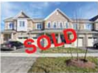
SOLD at 108% of asking in 6 Days