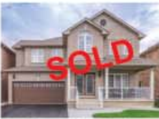
Secured Great Deal for the Client