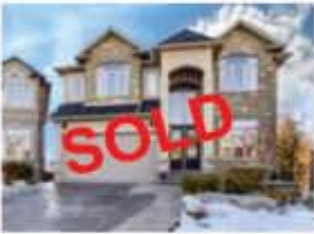
SOLD at 98% of Asking in 13 Days