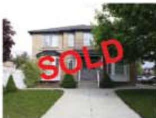
SOLD at 100% Asking