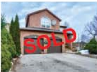
SOLD at 106% of asking in 10 Days