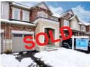
SOLD at 107% of asking in 4 Days