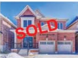
Secured GREAT Deal for Client