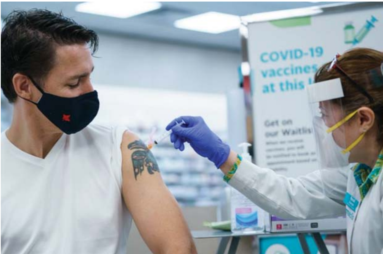
PMJUSTINTRUDEAU RECEIVES SECOND DOSE OF MODERNA VACCINE TODAY 'VACCINES ARE OUR PATH TO BETTER DAYS - SO MAKE SURE YOU GET YOUR SECOND DOSE WHEN YOU CAN:' PM TRUDEAU.