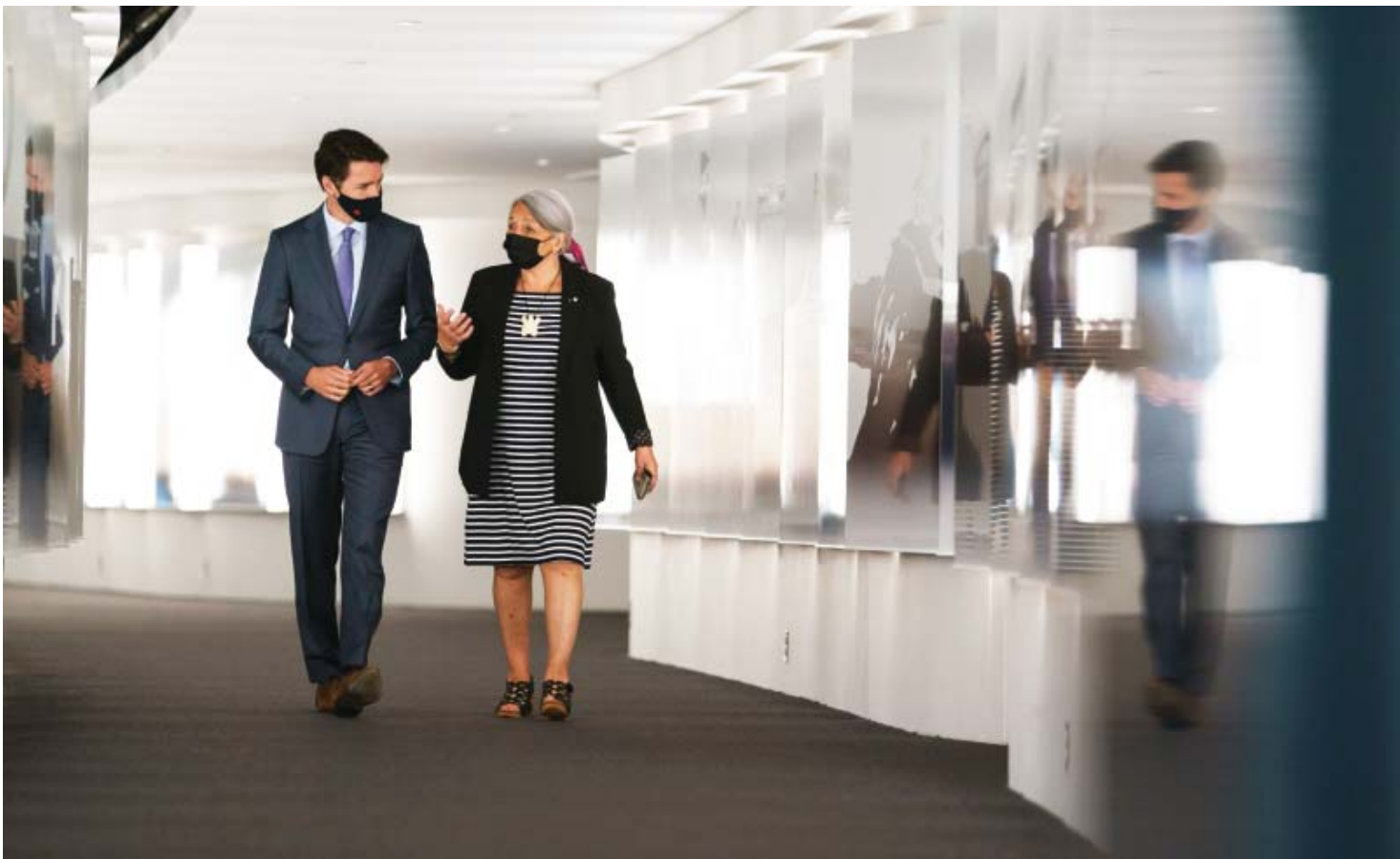
PM TRUDEAU APPOINTS MARY SIMON AS FIRST INDIGENOUS & 30TH GOVERNOR GENERAL OF CANADA. | DETAILS ON PAGE 7