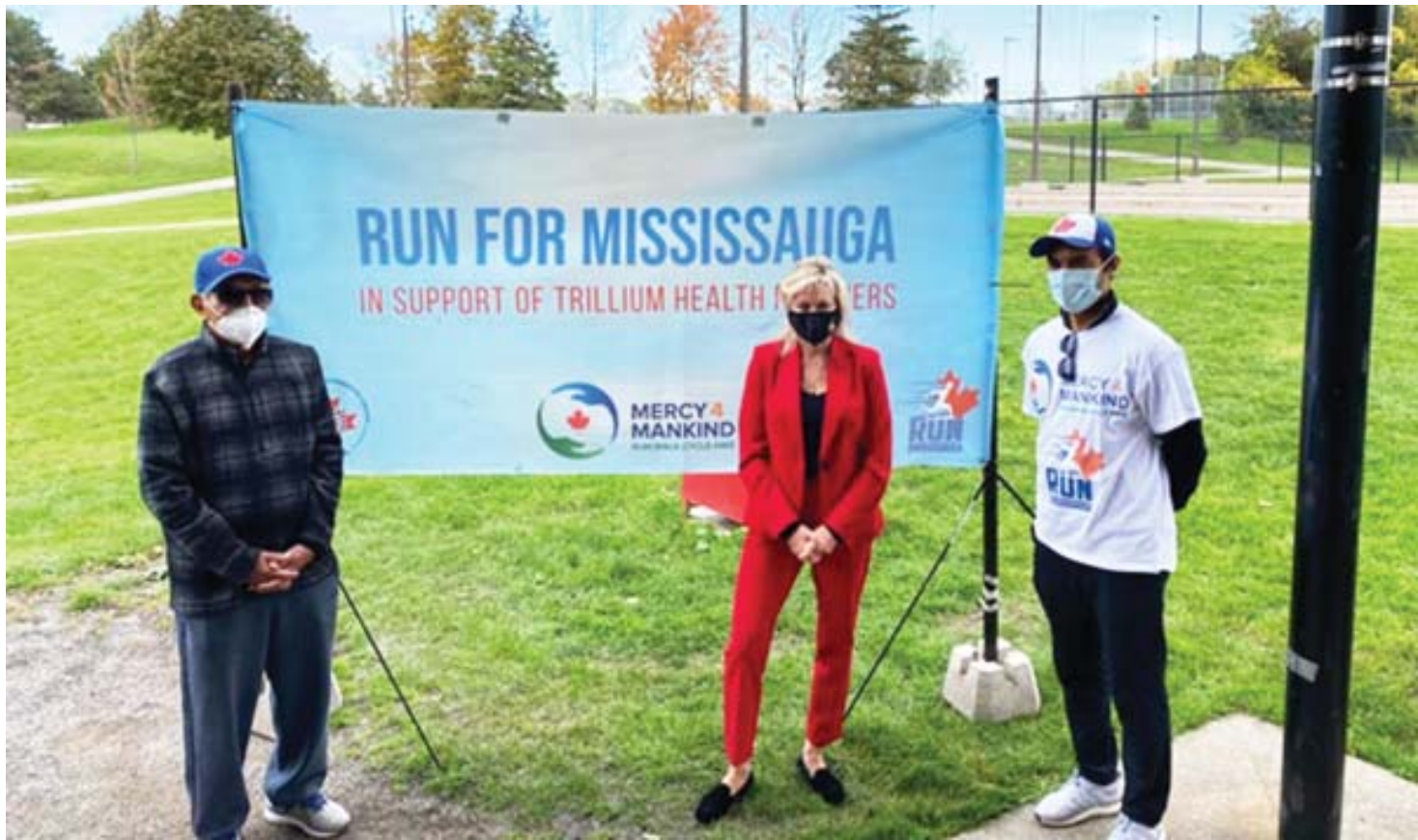
Y MEDIA TEAM ATTENDS 'RUN FOR MISSISSAUGA,' AN EVENT ORGANIZED BYAHMADIYYA MUSLIM YOUTH ASSOCIATION TO RAISE FUNDS FOR THE REDEVELOPMENT OF TRILLIUM HEALTH PARTNERS MISSISSAUGA HOSPITAL.