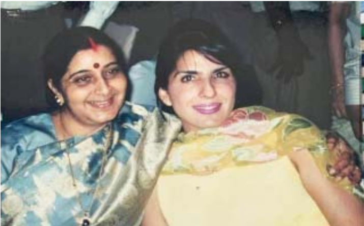
WITH UNION EXTERNAL AFFAIRS MINISTER LATE SMT. SUSHMA SWARAJ DURING THE AGRA SUMMIT.