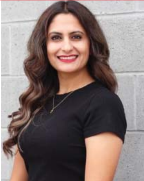
BRAMPTON WEST MP KAMAL KHERA BECOMES MINISTER FOR SENIORS & IS THE YOUNGEST MEMBER OF CABINET.