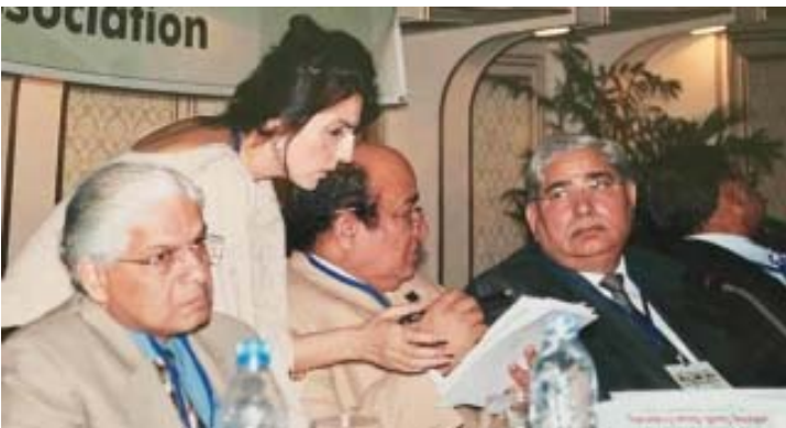
WITH UNION LAW MINISTER ASHWANI KUMAR DURING THE SFMA MEET IN ISLAMABAD.