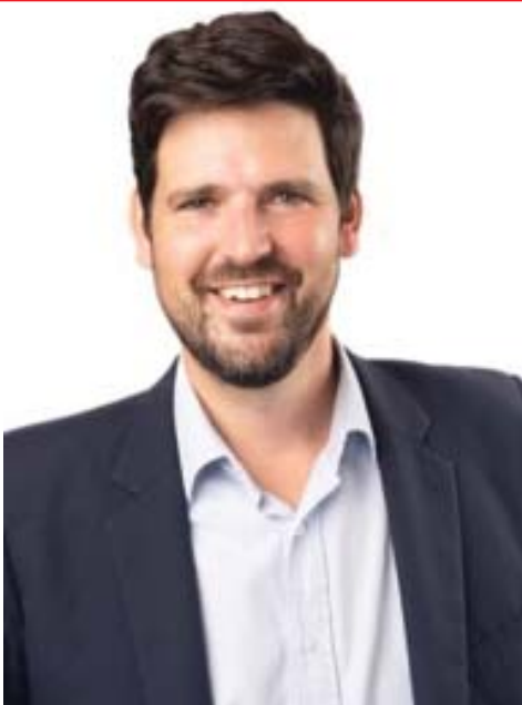
SEAN FRASER BECOMES MINISTER OF IMMIGRATION, REFUGEES AND CITIZENSHIP