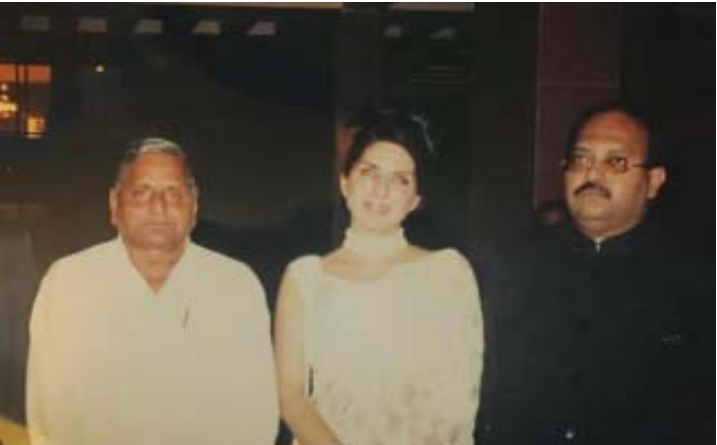
WITH UTTAR PRADESH CHIEF MINISTER MULAYAM SINGH YADAV AND AMAR SINGH.