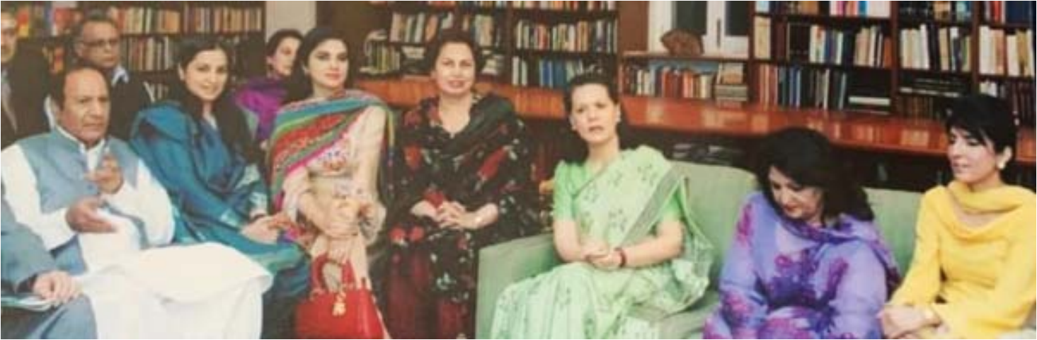
WITH SMT. SONIA GANDHI AS PART OF A DELEGATION WITH CH SHUJAHAT FOR A PARTY INITIATIVE.