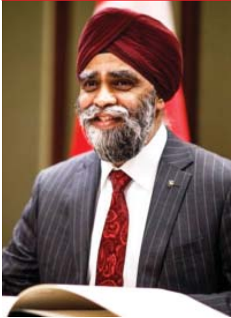
HARJIT SAJJAN BECOMES MINISTER OF INTERNATIONAL DEVELOPMENT & MINISTER RESPONSIBLE FOR THE PACIFIC ECONOMIC DEVELOPMENT AGENCY OF CANADA.