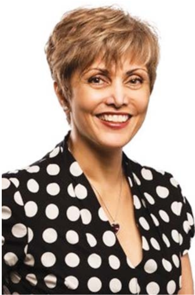
JYOTI GONDEK WILL BE FIRST WOMAN TO SERVE AS CALGARY MAYOR