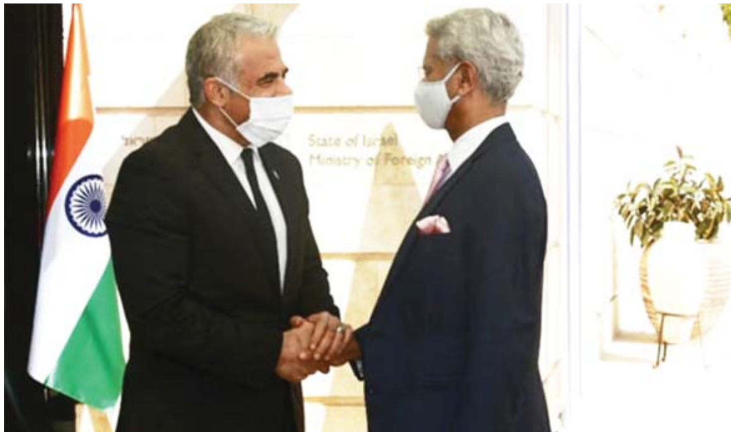
INDIA'S EXTERNAL AFFAIRS MINISTER (EAM) S. JAISHANKAR HOLDS 'PRODUCTIVE TALKS' WITH ISRAELI COUNTERPART, AGREES TO RENEW NEGOTIATIONS ON FTA AGREEMENT.