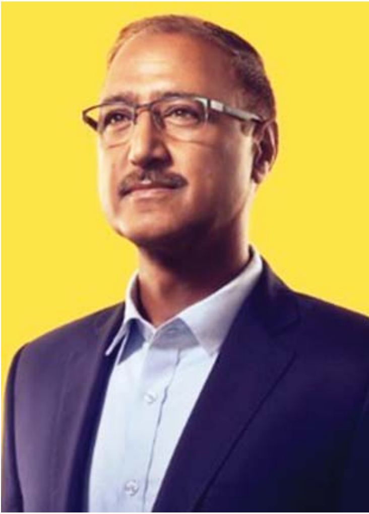
FORMER FEDERAL CABINET MINISTER AMARJEET SOHI BECOMES MAYOR OF EDMONTON.