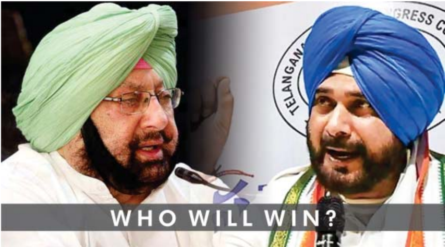
Y MEDIA PUNJAB POLITICAL SENSEX- WHO WILL WIN: CAPT. AMARINDER SINGH OR NAVJOT SINGH SIDHU? | DETAILS ON PAGE 5