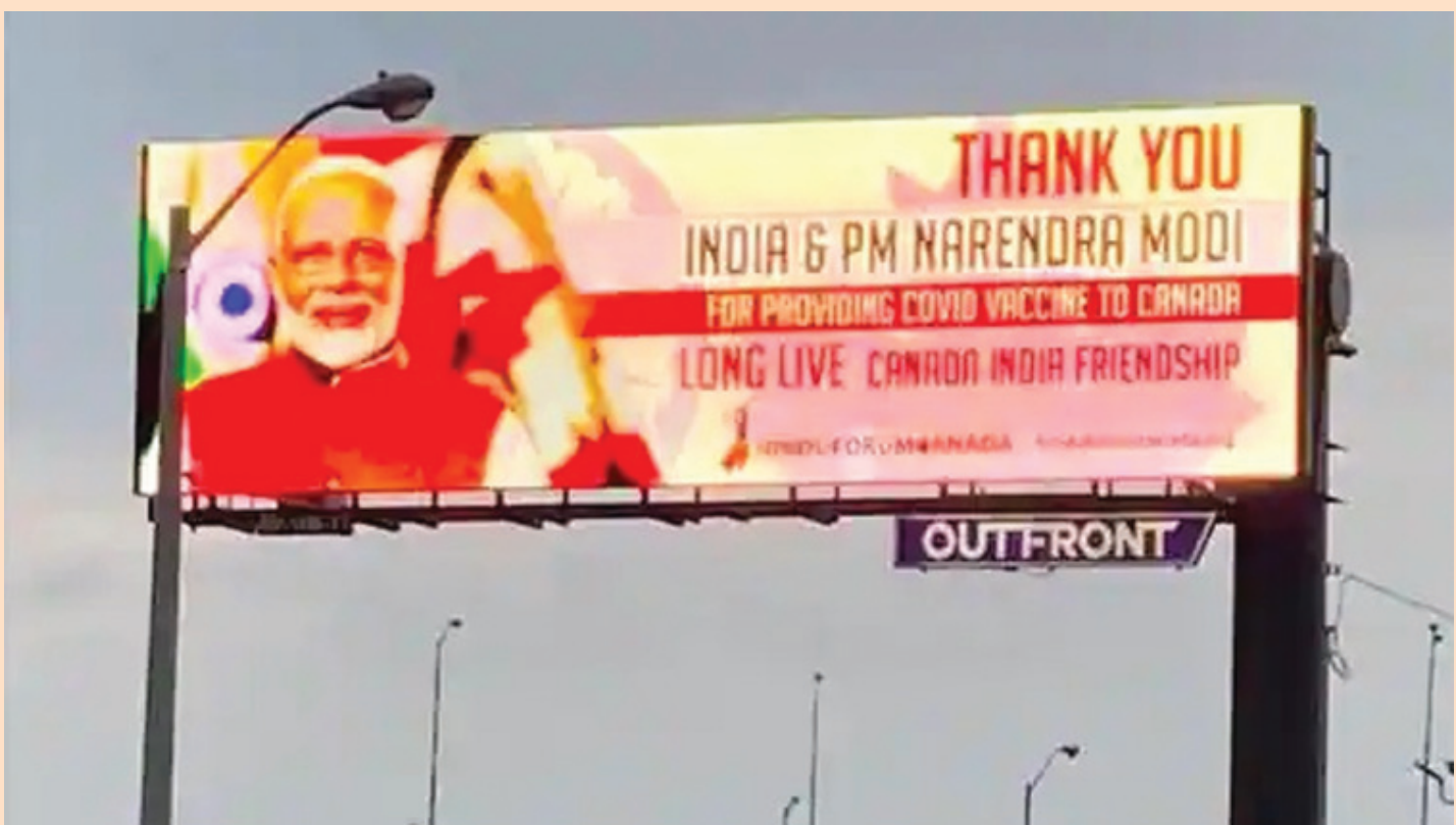
HUGE BILLBOARDS IN CANADA MENTIONING 'THANK YOU INDIA, THANK YOU PM MODI' AFTER CANADA RECEIVES 500,000 COVISHIELD VACCINES.