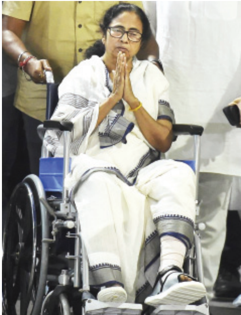
MAMATA, ON WHEELCHAIR, LEADS 5-KM LONG ROADSHOW IN KOLKATA