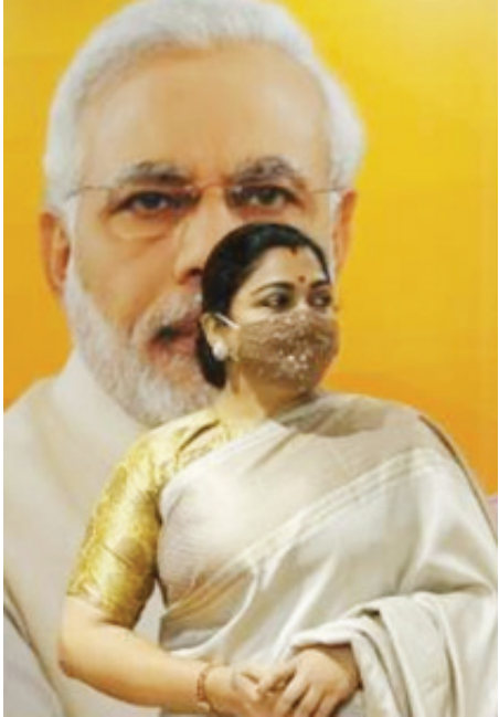
TAMIL NADU POLLS: BJP FIELDS KHUSHBU SUNDAR