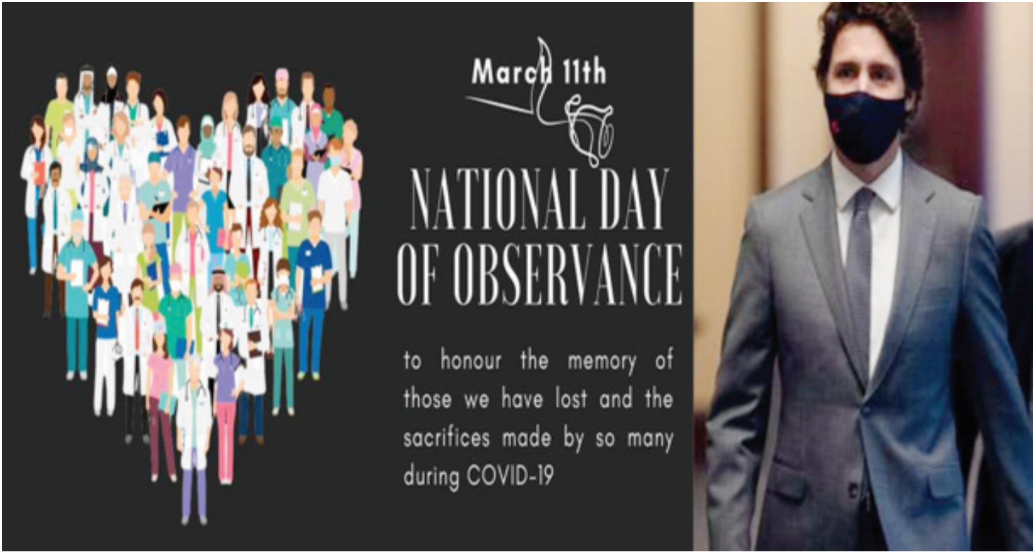
ON NATIONAL DAY OF OBSERVANCE (MARCH 11), CANADA MOURNS LOSS OF LIVES DUE TO COVID-19 PANDEMIC.