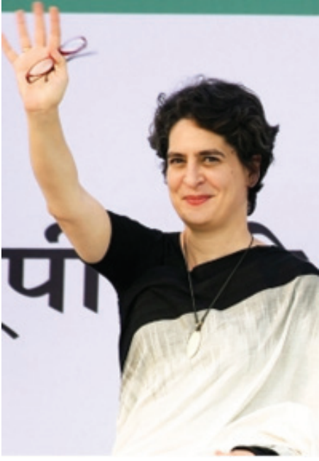
DEMAND GROWING FOR PRIYANKA TO CAMPAIGN IN POLL-BOUND STATES