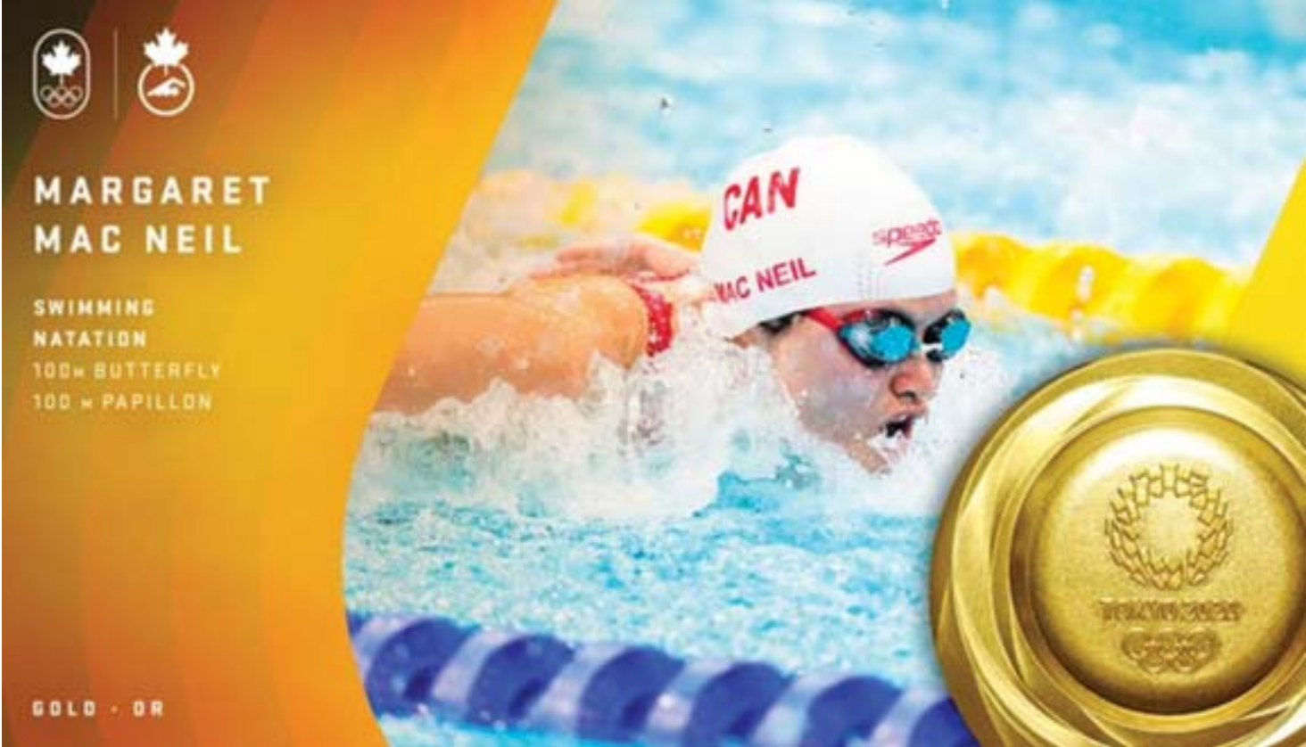
OLYMPICS-SWIMMING-MAGGIEMAC NEIL WINS FIRST GOLD FOR CANADA.