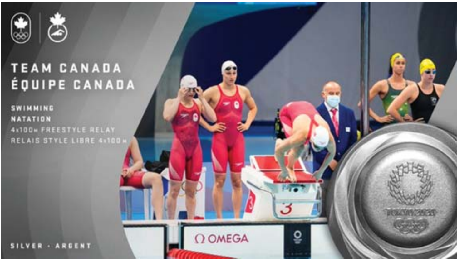
TOKYO2020 : CANADA WINS SILVER IN WOMEN'S 4X100 FREESTYLESWIMMING RELAY (TEAM CANADA/ TWITTER).