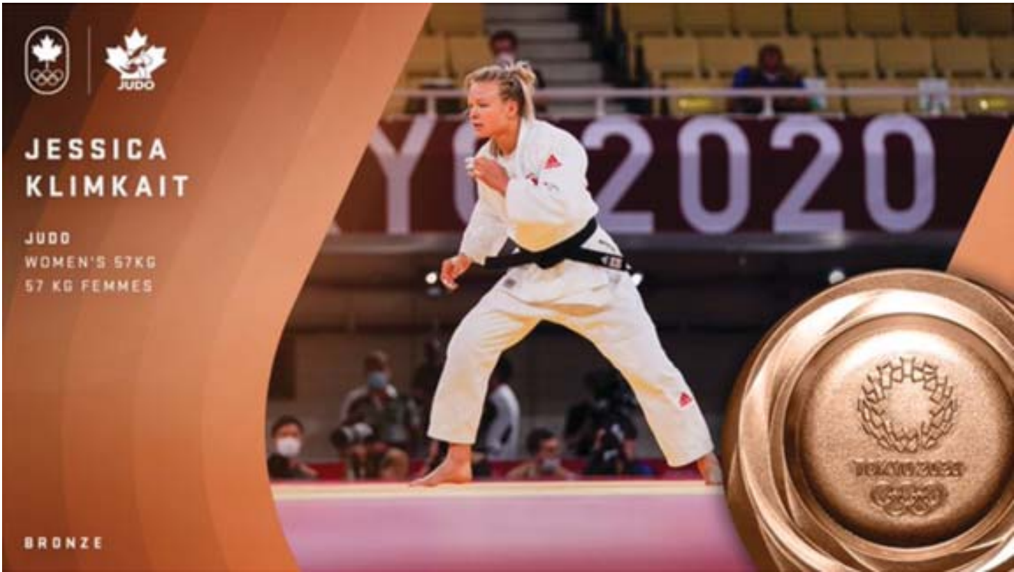
OLYMPICS -JUDO-JESSICA KLIMKAIT WINS BRONZE FOR CANADA (TEAM CANADA/ TWITTER).