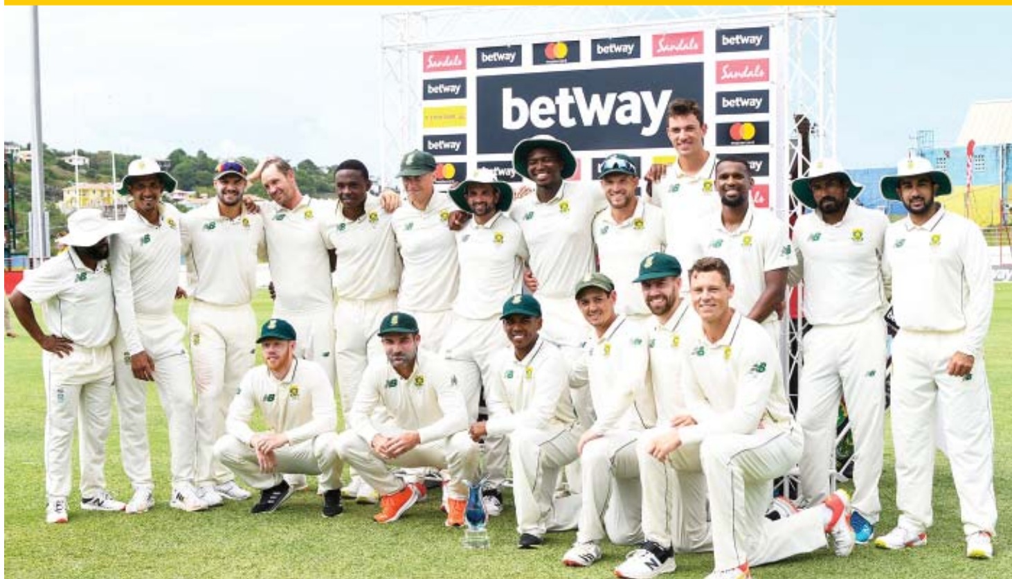
THE SOUTH AFRICA SQUAD CELEBRATE THEIR SERIES WIN, WEST INDIES VS SOUTH AFRICA, 2ND TEST, GROS ISLET, 4TH DAY, JUNE 21.

TO WATCH ALL THE LATEST GOSSIP IN ENTERTAINMENT, WATCH CHANNEL Y ROGERS 857, BELLFIBE 828, TELUS 2418