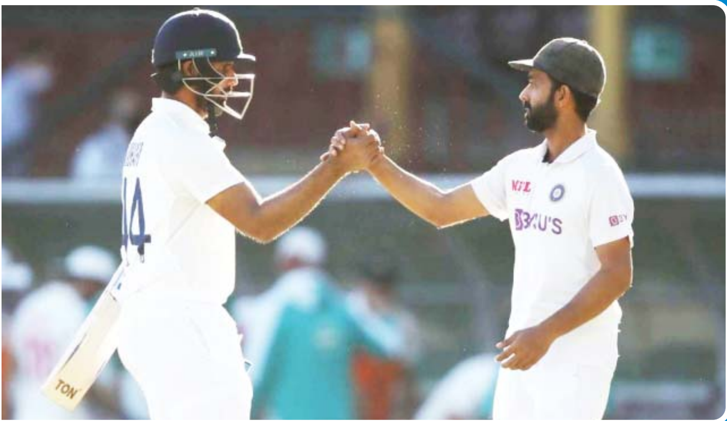
SKIPPER AJINKYA RAHANE WAS DELIGHTED WITH THE FIGHT TEAM INDIA SHOWED ON THE FIFTH DAY AND HEAPED PRAISED ON HANUMA VIHARI AND RAVICHANDRAN ASHWIN.

Skipper Ajinkya Rahane was delighted with the character Team India showed on Monday and fought till the end to save the third Test against Australia in the ongoing Border-Gavaskar Trophy. India needed 309 runs at the start of the day and Australia needed 7 wickets effectively, even though Ravindra Jadeja was shown padded up. Asked about his feelings at the end of the game and what was the best thing that he was proud of on Day 5 of the SCG Test, Rahane said, "I think our talk, this morning was all about showing character today, fight till the end, not to think about results. Team showed its character. "Really happy, the way we fought especially today, but also throughout the game, even in the first innings when Australia were 200 for 2 and from there getting them all out for 338 was really good. There are few areas we can improve on but special mention to Vihari and Ashwin in the end the way they batted was really good to see." India came back storming into the game on the second day of the Test after they broke the Marnus Labuschagne-Steve Smith partnership. Despite Smith's magnificent century, Australia were bowled out for 338 after losing their last six wickets for 89 runs. Needing 309 runs on the fifth morning, India lost Rahane's wicket in just the seventh over of the first hour as India promoted left-hander Rishabh Pant to No 5. But that move turned out to be a genius one as Pant played a whirlwind knock of 97 runs to keep India alive in the