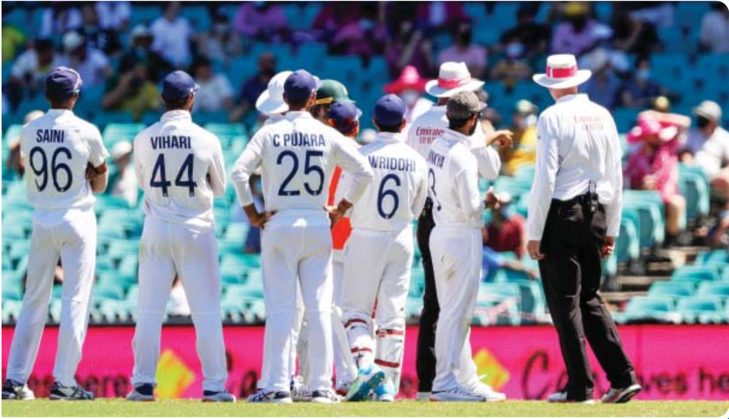
THE INDIAN TEAM LODGED AN OFFICIAL COMPLAINT AFTER THE CROWD AT THE SCG RACIALLY ABUSED PACERS JASPRIT BUMRAH AND MOHAMMED SIRAJ.

Former Australian cricketers Michael Hussey and Shane Warne have condemned the racial abuse at the Sydney Cricket Ground (SCG) during the Test match between India and Australia. The Indian team on Saturday lodged an official complaint after the crowd at the SCG racially abused pacers Jasprit Bumrah and Mohammed Siraj over the second and third day of the ongoing Pink Test between India and Australia. "It's terrible behaviour and I can't believe it's still happening in this day and age. They should be banned for life from coming to cricket. The Indians have come here to our shores to entertain us, play some great cricket, we should be so grateful that we can watch some live sport. To treat the players like that is unacceptable," Hussey told Fox Cricket. Warne also said that "severe punishment" should be given to the members of the crowd who hurled racial slurs at Siraj and Bumrah. "Disgraceful to be honest, absolutely disgraceful. Should never happen, especially what's happened in the last 12 months or so with everything else around the world. Let's hope they come down heavy and find the culprits," said Warne. On Saturday, speaking to ANI, a BCCI official in the know of developments said that the Indian cricket board stands with the boys as such behaviour is "unacceptable".