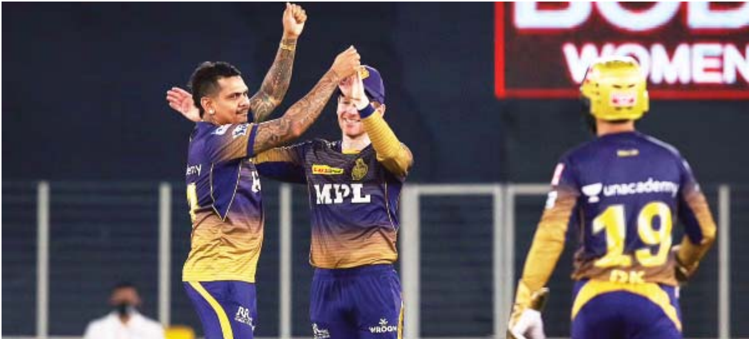
KKR DEFEAT DELHI CAPITALS BY 3 WICKETS AND 10 BALLS TO SPARE IN SHARJAH, IPL TWITTER HANDLE.