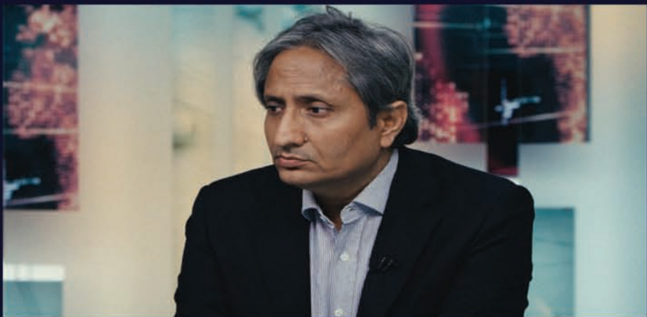
WHILE WE WATCHED