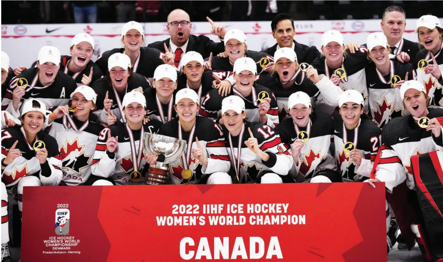
THE CANADIAN WOMEN'S HOCKEY TEAM POSE WITH THE TROPHY AND THEIR GOLD MEDALS FOLLOWING THEIR 2-1 WIN OVER THE UNITED STATES ON SUNDAY IN THE WOMEN'S HOCKEY WORLD CHAMPIONSHIP FINAL IN HERNING, DENMARK.