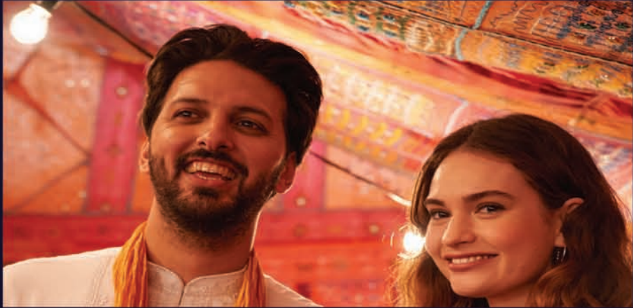
WHAT'S LOVE GOT TO DO WITH IT