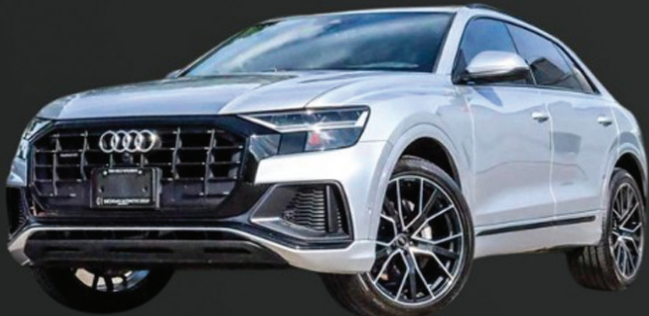
2021 Audi Q8 55 Progressive