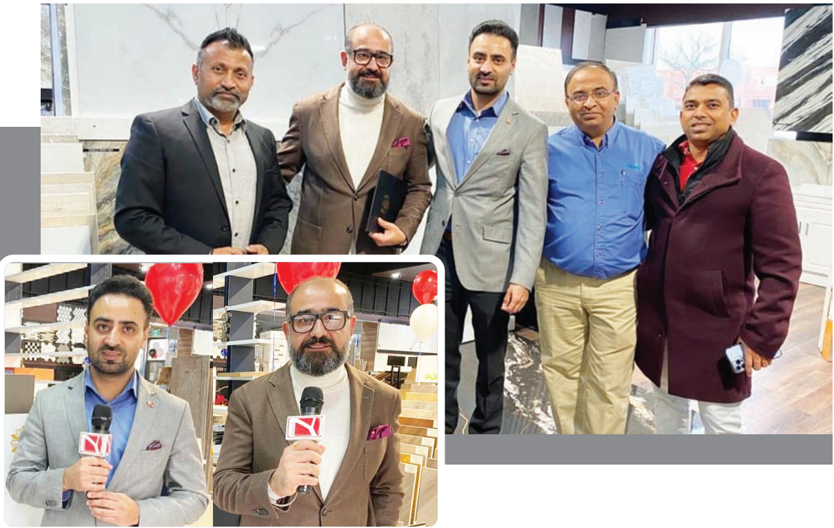
Y MEDIA TEAM AT MANAGING COMMITTEE OF BUILDER'S BLISS STONE & TILES OF PARADISE'S ALL DAY SALES EVENT