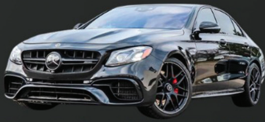
2020 Mercedes-Benz S-Class AMG E 63