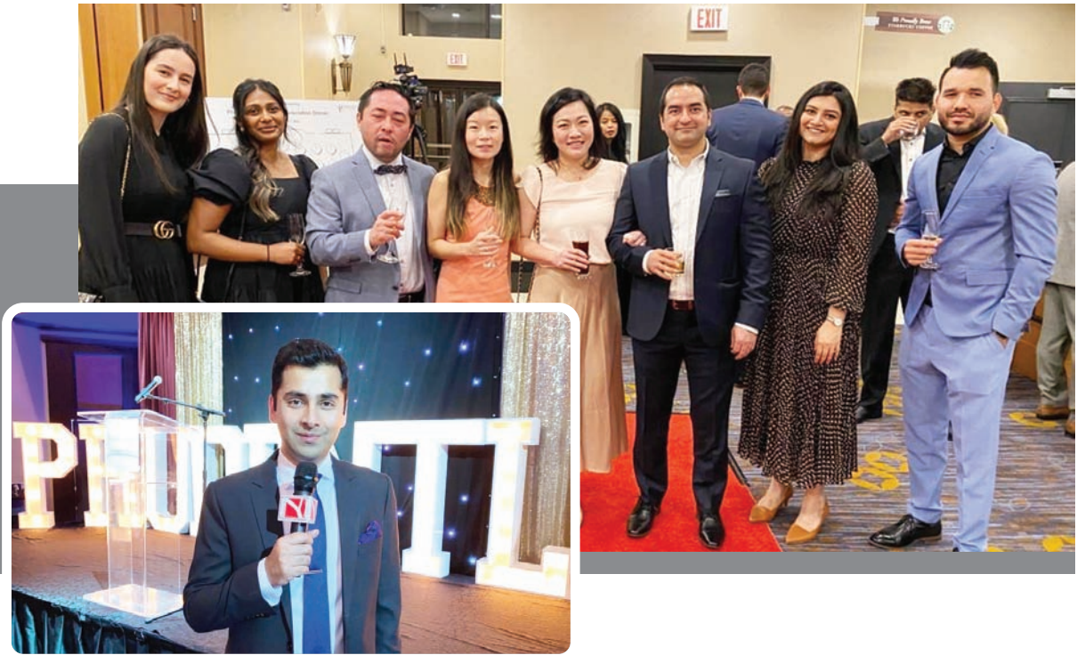
Y MEDIA TEAM AT PRUDENT LAW'S 2022 CLIENT APPRECIATION DINNER IN BRAMPTON