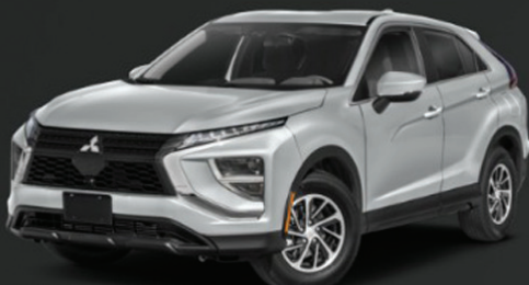
2023 Mitsubishi Eclipse Cross