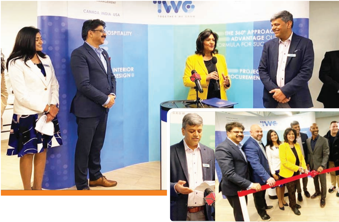
Y MEDIA TEAM AT THE OPENING CEREMONY OF THE NEWLY DESIGNED STUDIO OF HEMEN MODI WITH TEAM TWG