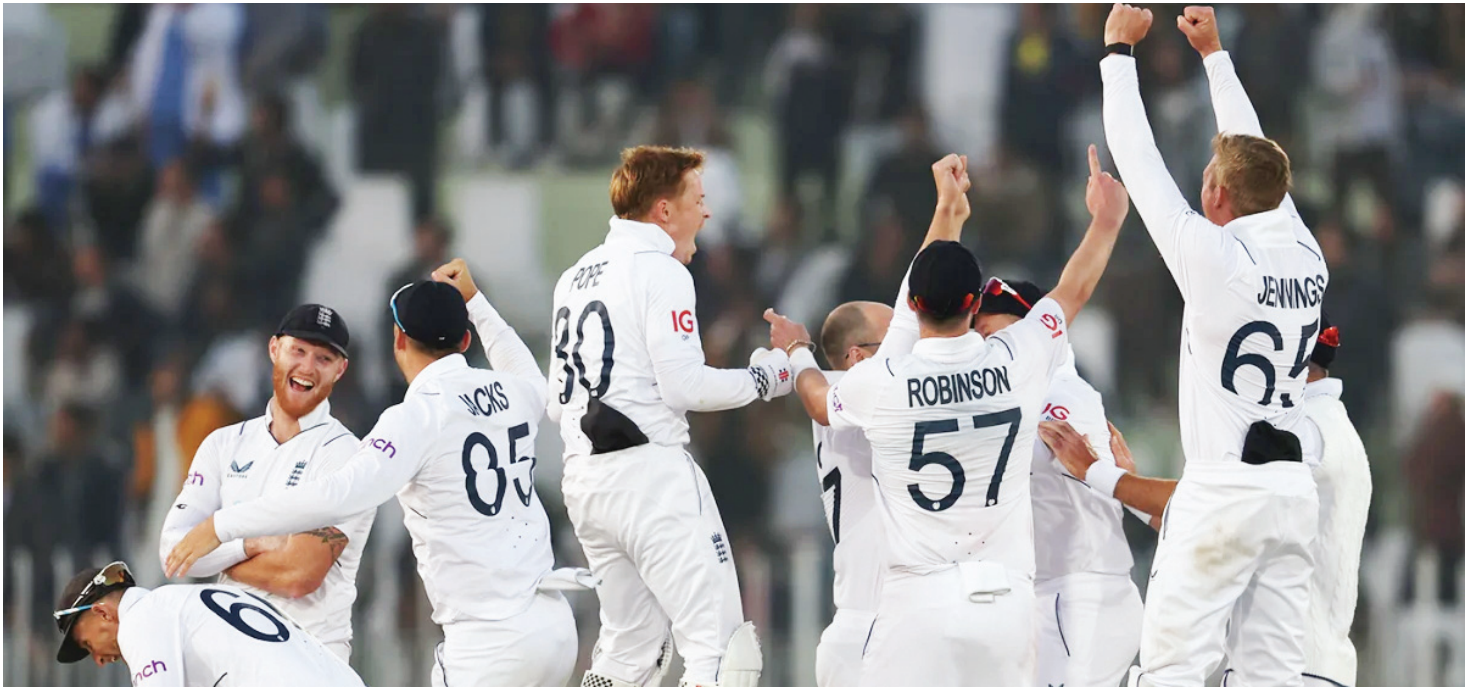
ENGLAND CELEBRATE THE MOMENT OF VICTORY AS JACK LEACH SEALS THE FIRST TEST • DEC 05, 2022.