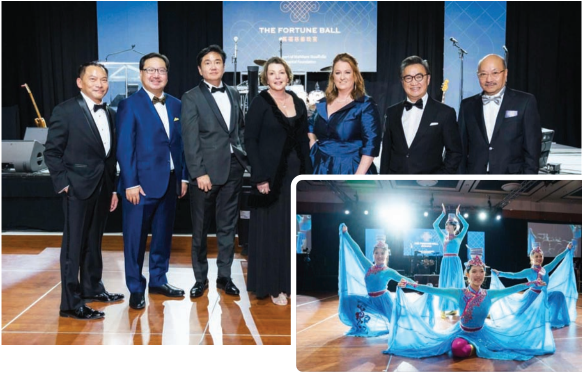
CHINESE COMMUNITY COMES TOGETHER TO SHOW SUPPORT AT MARKHAM STOUFFVILLE HOSPITAL FOUNDATION'S INAUGURAL THE FORTUNE BALL