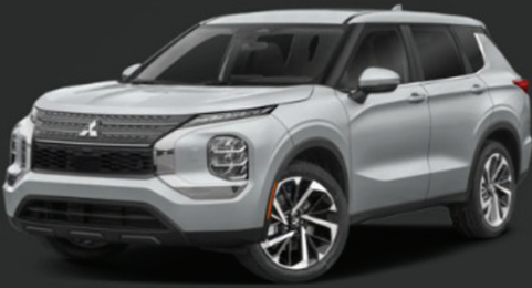
2023 Mitsubishi Outlander