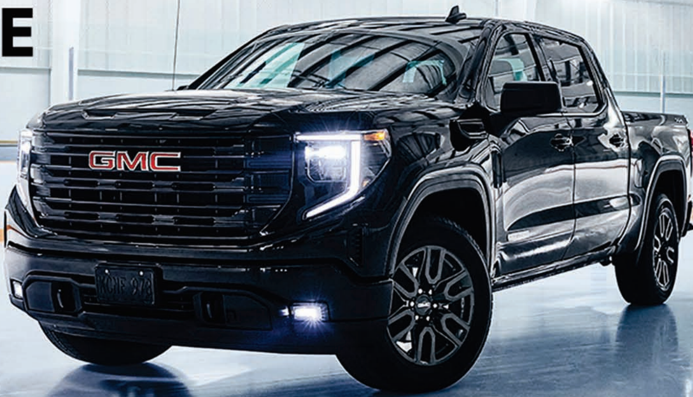
2022 GMC SIERRA 1500 ELEVATION CREW CAB