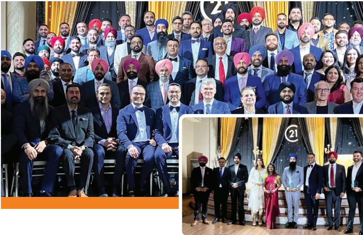
Y MEDIA TEAM AT CENTURY 21 PRESIDENT REALTY INC. BROKERAGE'S CHRISTMAS & HOLIDAY GALA, 2022, IN BRAMPTON