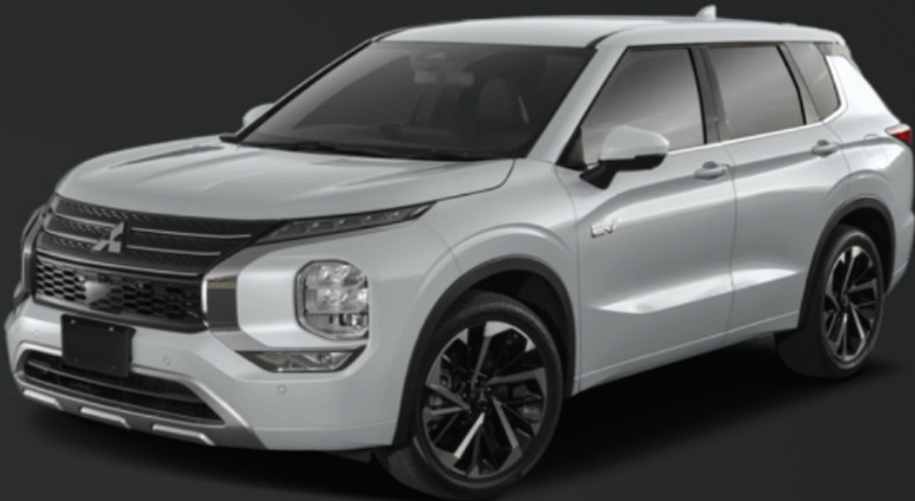
2023 Mitsubishi Outlander PHEV