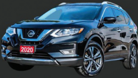
2020 Nissan Rogue